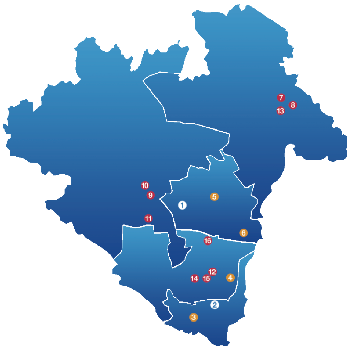
Figure 1B: Map showing locations of schools within Telford & Wrekin