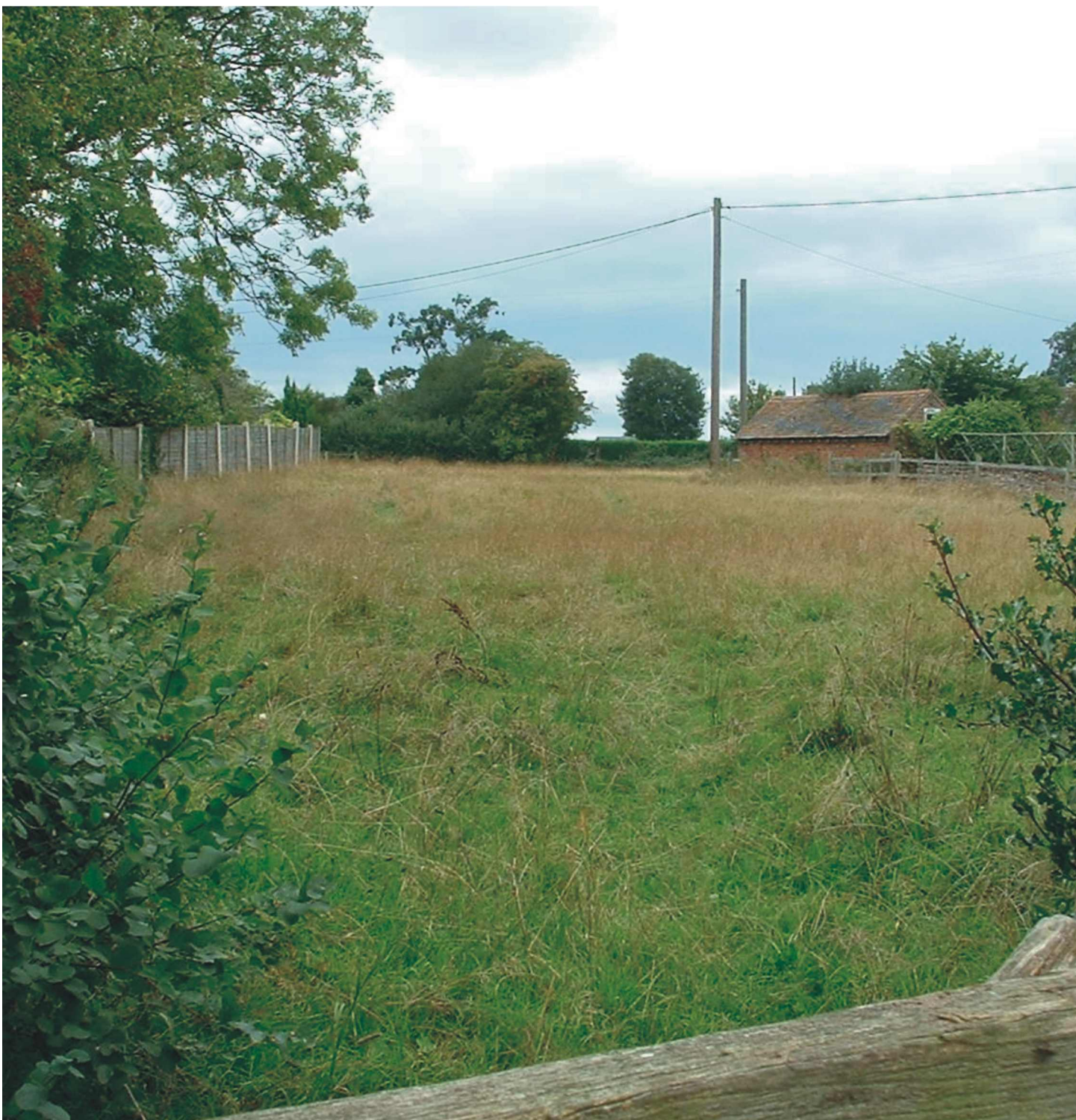
Areas of potential ridge and furrow proposed for inclusion into High Ercall Conservation Area

archaeological deposits of scatters may be possible. Little invasive archaeological work has been carried out in High Ercall and any opportunity for such, allowed under PPG16 Archaeology and Planning (DoE 1994) should be explored.