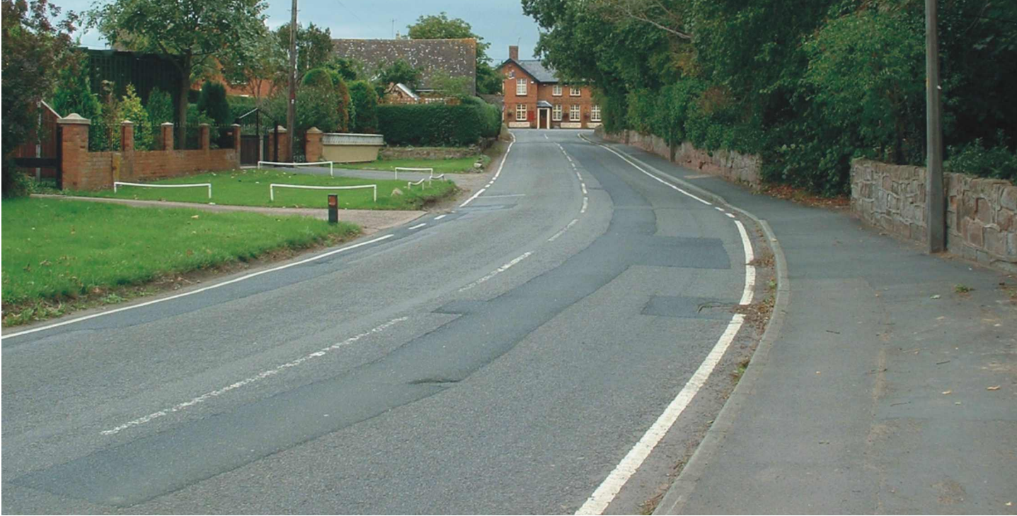
The Cleveland Arms is in a prominent location at the junction of the B5062 and B5063 and forms the northern terminus point to the High Ercall Conservation Area.

The property is a pleasantly proportioned 19th century red brick and slate building, with a prominent gabled wing to the left. It has large mullioned wooden windows (through some of the windows have been replaced, presumably mid to late 20th century). It has a small extension to the eastern end in keeping with the original. It was built as a school in the 19th century, before becoming a pub and something of the character of the school can still be seen in the style of the windows, which