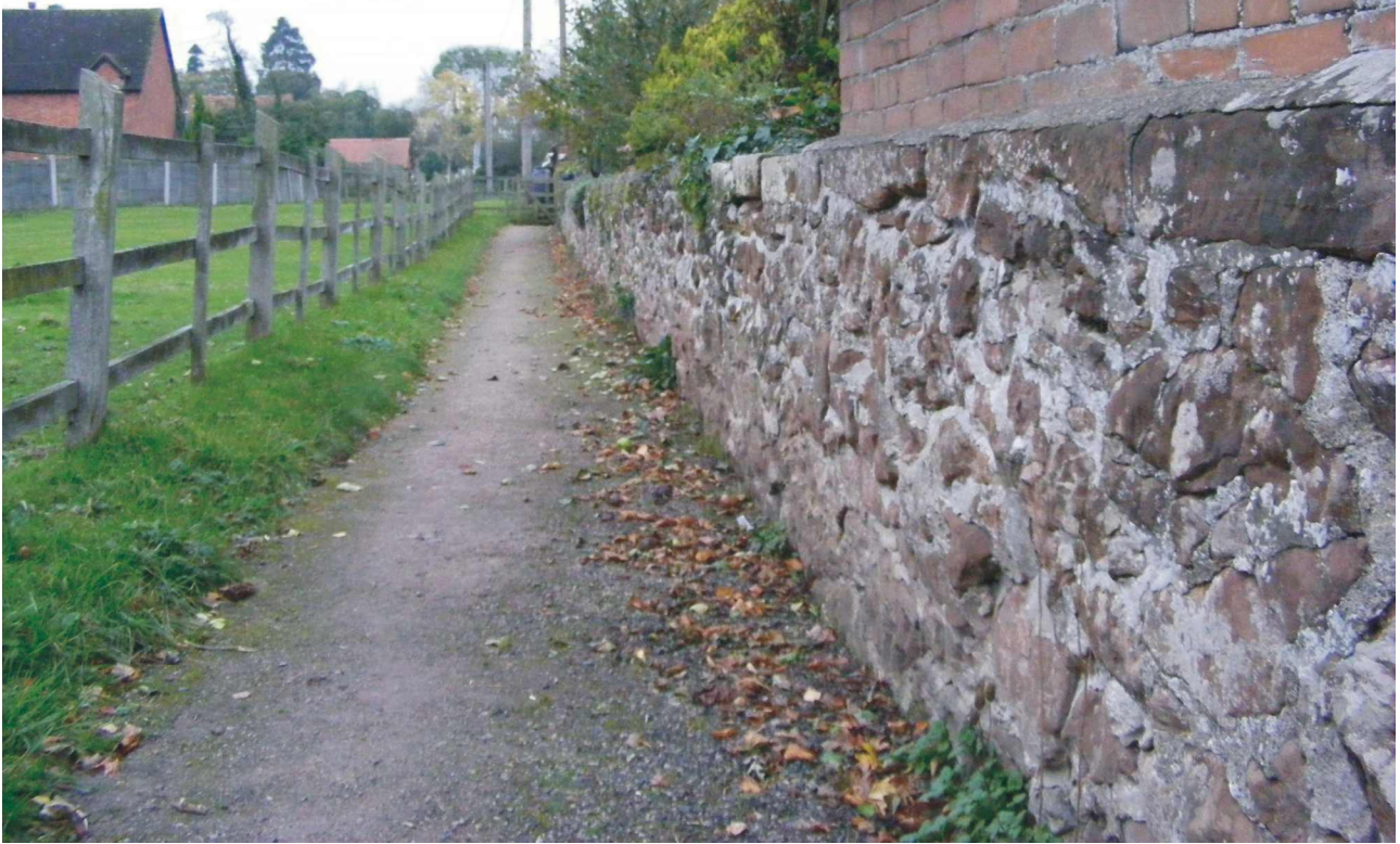
Sandstone wall fronting the properties off Park Lane.

As well as rationalising the boundary and offering a protective buffer zone, the extension here will bring in an open green area. The field has a pleasant pastoral feel and reflects the character of the surrounding landscape and its use. There are a number of mature oaks along the boundary which contribute positively to the pastoral feel of the site. Similarly the two adjoining field plots running south from Park Lane and between the dwellings on Glebelands and Shrewsbury Road, would also provide some protection to the existing properties within the Conservation Area along Shrewsbury Road. The field leading immediately off Park Lane borders with a row of properties, in - between the two is an access footpath the boundary with the dwellings is a very nice sandstone rubble wall, which it would be beneficial to bring into the Conservation Area as this type of boundary construction is a core feature of the Conservation Area.