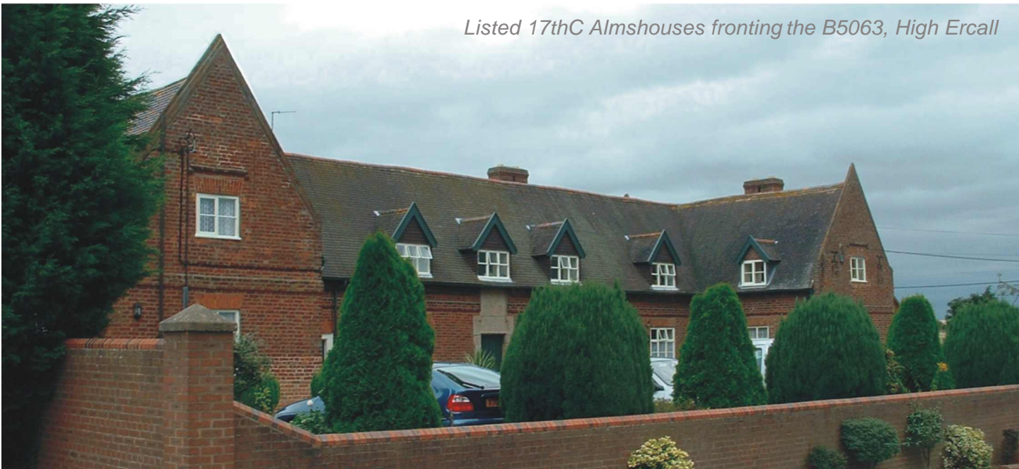
Listed 17thC Almshouses fronting the B5063, High Ercall

incorporates a dedication tablet bearing the date 1694. The property is relatively unspoilt, though the windows have been altered some time ago. It is unfortunate that the surrounding wall has been inappropriately re-built but altogether the wall, piers and houses form a pleasant group. The historical association of this historic building and its relationship with the history of the church and village makes it a significant property within the medieval/post medieval core of High Ercall.