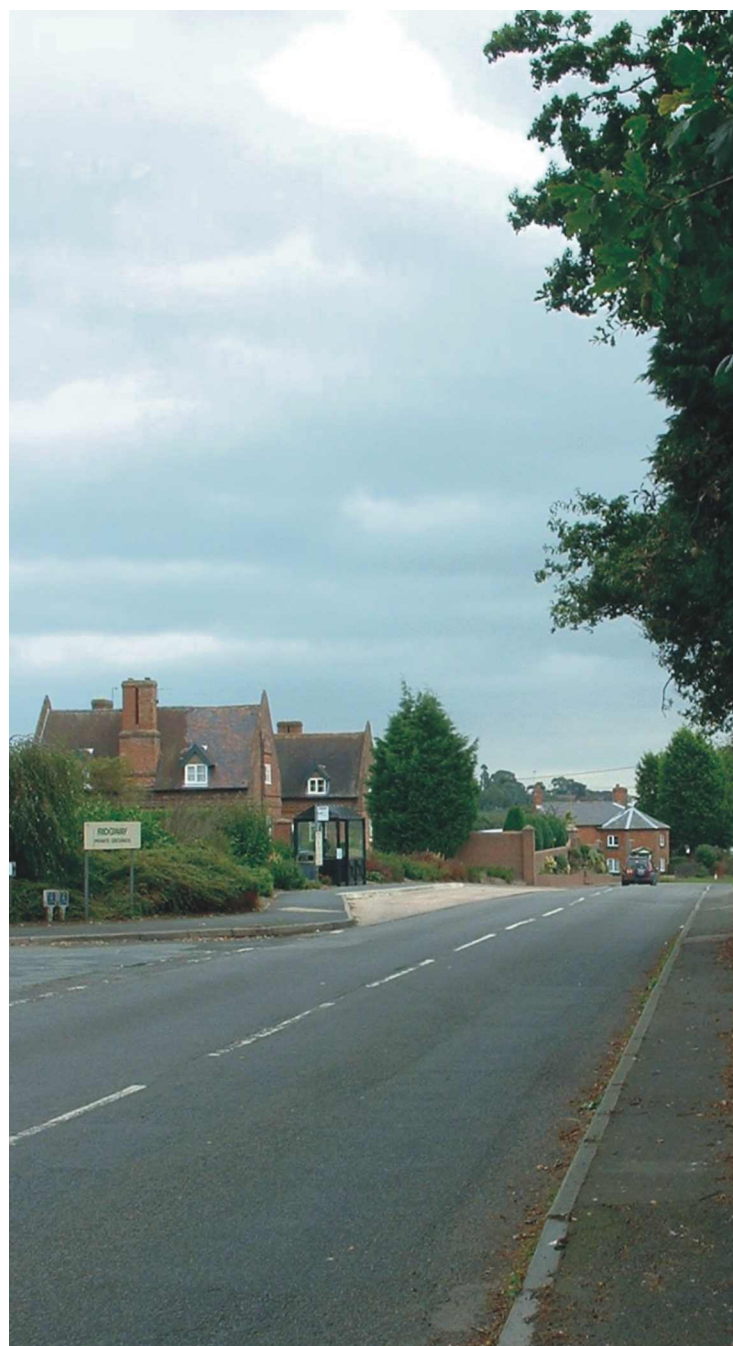
The Almshouses and The Toll House

old medieval core of High Ercall have been omitted from the Conservation Area. Principally, these include, The Cleveland Arms PH, The Almshouses and the Toll House - all sited along the B5063, all three forming key elements of the historic landscape of High Ercall.