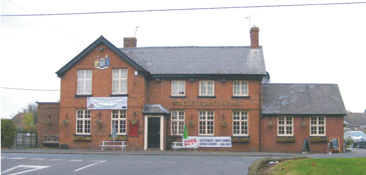
The Cleveland Arms PH where it forms a terminal point with the B5063

are clearly not of a domestic scale. It is a quite dominant building when taken together with its prominent location (where it is one of the few buildings that fronts on to the road) and to consider an appraisal of the character of the existing Conservation Area without including the Cleveland Arms PH is a clear omission and therefore its inclusion within the boundary is being proposed here.