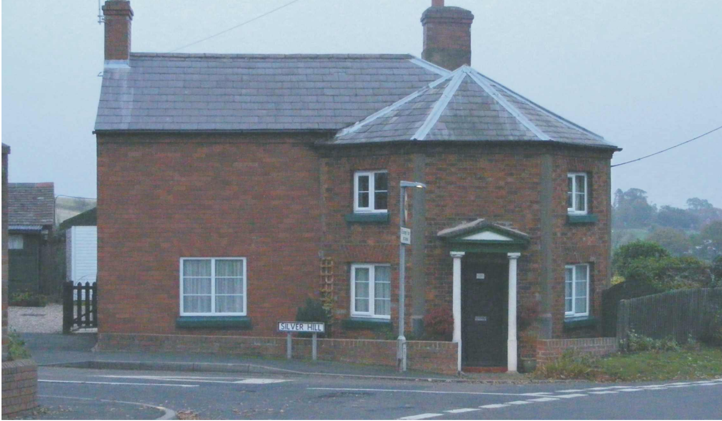
The Toll House, High Ercall

The early to early to mid 19th century Toll House is a two storey semi-octagonal in form with a splayed frontage, allowing clear views of the road either side, typical of toll houses of this age. It is principally built of contrasting red brick and stone details to the corner edges, with a low pitched roof of slate and a stone plinth, standing at the side of the old Newport to Shrewsbury Road. The original building is relatively unchanged though an overly dominant two storey extension has been built on the North West elevation. The original portion of the house has had some insensitive replacement windows inserted but has otherwise survived with its character intact. It is the first building reached on entering High Ercall from the east and essentially sets the tone for the Conservation Area. Its presence indicates that this is a settlement of some age and local historical significance in terms of historic routes, it is a gateway building to the Conservation Area.