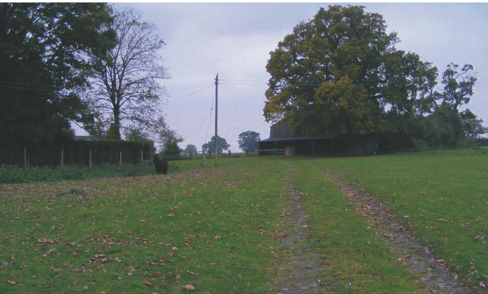
Field to the south west of the conservation area showing some of the mature boundary oaks

the existing field splitting it in two, where no such division physically exists. Linked to this is the realisation that some parts of the Conservation Area are relatively narrow and that encroachment of development here may have a detrimental effect of the character which would only survive in thin belt. By rationalising the boundary to include the field as a whole, we would create a more easily definable boundary and create an additional buffer zone of green space within the conservation area which will offer protection to the existing central belt running between The Vicarage, Stackstones and The Grove. This area is also known to contain evidence of historic ridge and furrow.