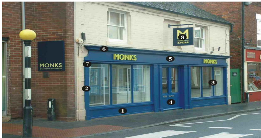
Picture 1 Elements of traditional shop front design