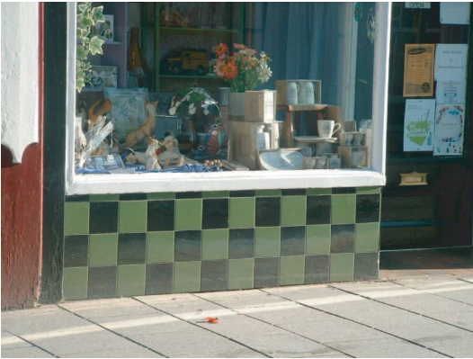
Picture 2 GOOD : A good example of a decorated stall riser, mid-late 20th century contrasting glazed tiles are used to good effect