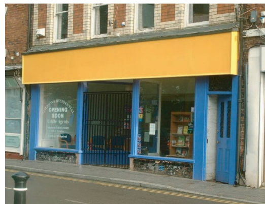
Picture 15 POOR : Oversized boxed out fascia board with no cornice or architrave or capitals to enclose it or support it. It dominates the shop front to an oppressive degree