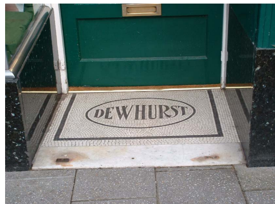
Picture 21 GOOD : Surviving mid 20th Century advertising mosaic in a doorway