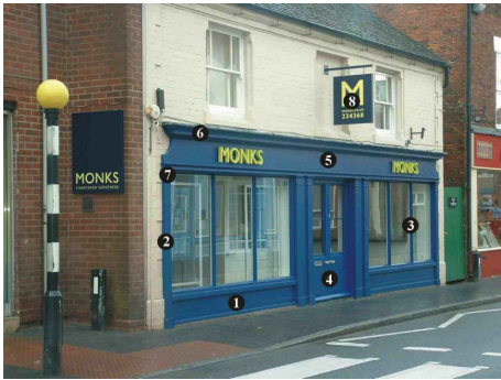
Picture 9 GOOD : Example of simple mullions used to reduce a large area of glass