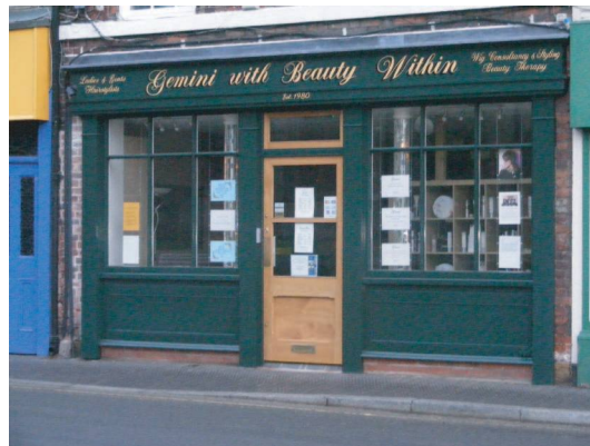
Picture 4 GOOD ; The same shop with a reinstated traditional shopfront