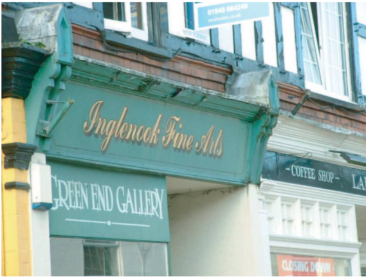
Picture 12 GOOD : Traditional fascia, with cornice above and small architrave below, enclosed with capitals and nicely proportioned sign