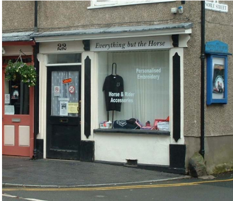
Picture 5 GOOD : Original pilasters with solid footings and moulded panels with bracket capitals to frame the fascia/signboard

6.6 New shop fronts should not be considered appropriate without pilasters or associated capitals and/or brackets, and where they are incorporated they should maintain a traditional fluted/reeded/panelled appearance together with a footing and a capital/bracket. Poor quality modern materials such as cheap plywood should be avoided whenever possible. Modern beadwork or picture mouldings on marine ply panels are not likely to be appropriate replacements for period material.