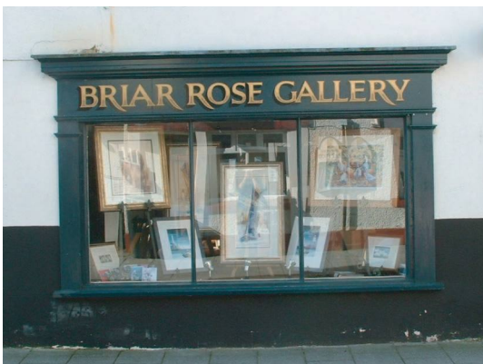
Picture 14 GOOD : Classical style entablature/fascia with simple hand painted signage