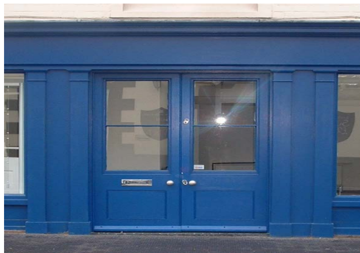
Picture 22 GOOD : Double doors used to create a wide easily accessible entrance

7.3 Internal and external alterations to commercial properties both at shop front level and the floors above may be subject to control under the Building Regulations (2000). However there are some exemptions for historic buildings under Part L of the regulations, the Building Regulations (2000) (Part L) defines historic building as either a listed building, building within a conservation area, buildings of local interest or buildings within AONB or World Heritage Sites. Whilst the Council will generally not resist building regulations which affect issues of health and safety, we reserve the right to resist under Part L of the Building Regulations, any other alteration which is likely to have a detrimental affect on the character of the building or the Conservation Area.