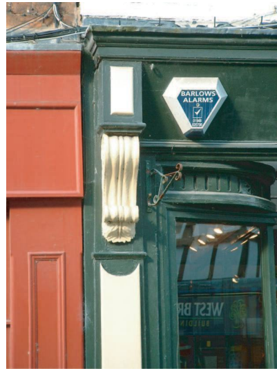
Picture 8 Good : Raised panels on the columns and bracketed capital above contrasting paint finish picks out the architectural detail