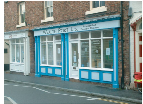
Picture 10 GOOD : Example of the use of high level transom to create to allow ventilation