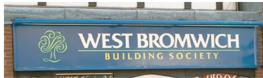
Picture 25 GOOD : Unobtrusive trough lighting running along the top of the sign board

8.5 Internally lit signs are not appropriate for a Conservation Area and applications for such will be rejected. If lighting is required it should be external in the form of unobtrusive colour co-ordinated trough lighting or some halo effect lighting for example. Swan neck lights will also be resisted. It is common misconception that these are traditional, and whilst they may appear traditional in form, the reality is that there is no traditional lighting source for commercial premises, this is a recent development. Swan neck lights are often used to excess on shop fronts and the result is often a cluttered appearance which can detract from an otherwise appropriate shop front/sign.