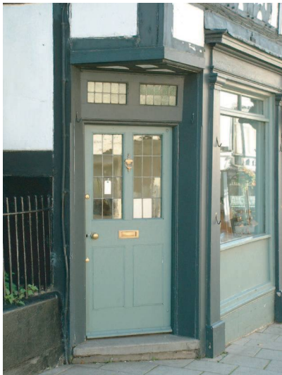
Picture 16 GOOD : Leaded glazed panels to upper lights picking up fanlight details

6.20 Doors traditionally had decorative brass work furniture such as handles, rubbing plates and letter boxes. Such door furniture should be respected and retained where it is of sufficient quality, and any replacements should be in appropriate style. Modern styles or materials such as plastic or stainless steel will not be appropriate in the Conservation Area.