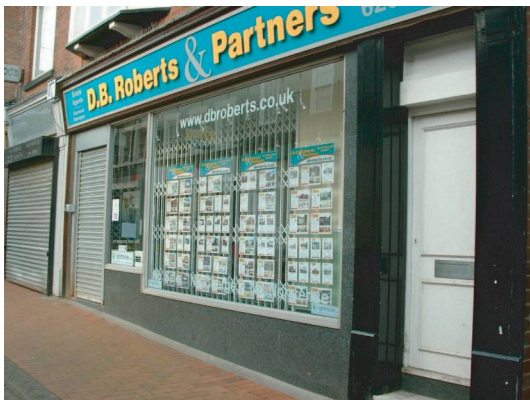
Picture 26 GOOD : Use of internal grilles on this modern shop front allows shop security to be maintained whilst allowing window shopping and advertising to continue out of hours, it provides a much better street impact that the shuttered property next door

9.8 Where external protection is required, the use of decorative ironwork grilles is recommended. These should cover the window or door area only and should be demountable for removal during the working day, storage for such grilles can be designed into a traditional style shop front. Alternatively external grilles similar to those above could be considered where appropriate and again only covering the window and door area so as to minimise any impact on the shop front. Where boxes are required to retract such grilles, these should be internal, i.e. located behind the fascia board, external boxes of any description will be refused.