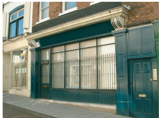
Picture 27 GOOD : Use of demountable decorative ironworks presents a much more appropriate frontage within a Conservation Area than roller shutters

9.9 Solid roller shutters will be rejected in Conservation Areas. Applications for other forms of shutters will be judged on a case by case basis and in respect of the impact the proposal will have on the Conservation Area. Applications that fail to demonstrate regard for the character of both the property and the Conservation Area will be resisted. It is accepted that certain businesses are at greater risk of criminal activity, such as jewellery shops. In such circumstances applications for security measures will be judged sympathetically on their individual merits but not to the detriment of the overall Conservation Area.