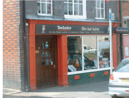
Picture 6 GOOD : Solid recessed panels to the columns, capitals and footings. It creates a solid terminus to the shop front and clear delineation between window and door