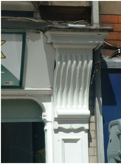
Picture 7 GOOD : Fluted capitals with a cornice at the top to give protection above a recessed moulded column