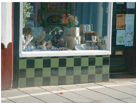
Picture 2 GOOD : A good example of a decorated stall riser, mid-late 20th century contrasting glazed tiles are used to good effect

4.3 Modern poorly designed shop fronts often dispense with the stall riser altogether in favour of a larger full height shop window. This is inappropriate for a Conservation Area. The stall riser is an integral part of the traditional shop front.