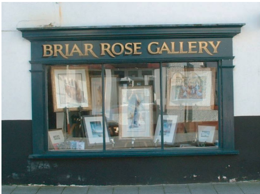
Picture 14 GOOD : Classical style entablature/fascia with simple hand painted signage