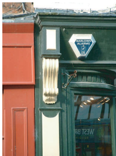
Picture 8 Good : Raised panels on the columns and bracketed capital above contrasting paint