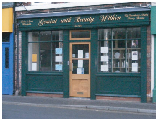
Picture 4 GOOD ; The same shop with a reinstated traditional shopfront