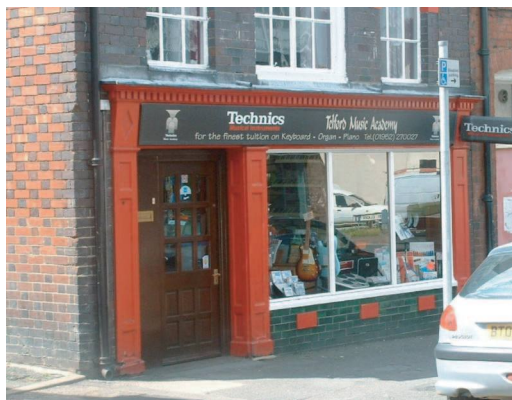
Picture 6 GOOD : Solid recessed panels to the columns, capitals and footings. It creates a solid terminus to the shop front and clear delineation between window and door