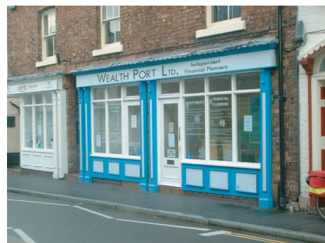
Picture 10 GOOD : Example of the use of high level transom to create to allow ventilation