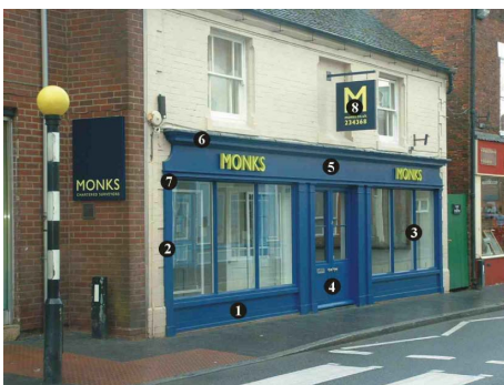
Picture 9 GOOD : Example of simple mullions used to reduce a large area of glass

4.12 Upper floor windows of commercial properties are considered part of the shop front and will therefore require planning permission for any removal, replacement or alteration. Upper floor windows are equally important in preserving the character and appearance of traditional commercial premises. Traditional designs and materials should be used and period material retained where possible. Designs should be appropriate to the overall character of the building/ traditional shop front. Replacement with inappropriate modern styles or materials will be resisted, also removal of glazing bars to allow in window advertising will also be resisted.