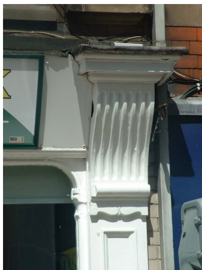
Picture 7 GOOD : Fluted capitals with a cornice at the top to give protection above a recessed moulded column

4.8 Capitals can follow traditional architectural forms such as ionic or Doric styles, particularly in the Georgian or early Victorian examples, or they can be more bespoke and decorative as in later Victorian and Edwardian frontages.