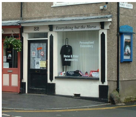
Picture 5 GOOD : Original pilasters with solid footings and moulded panels with bracket capitals to frame the fascia/signboard

modern materials such as cheap plywood should be avoided whenever possible. Modern beadwork or picture mouldings on marine ply panels are not likely to be appropriate replacements for period material.