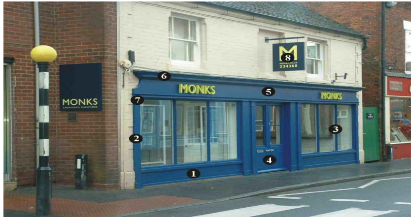
Picture 1 Elements of traditional shop front design