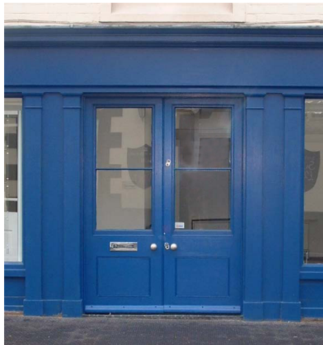
Picture 22 GOOD : Double doors used to create a wide easily accessible entrance

5.3 Internal and external alterations to commercial properties both at shop front level and the floors above may be subject to control under the Building Regulations (2000). However there are some exemptions for historic buildings under Part L of the regulations, the Building Regulations (2000) (Part L) defines historic building as either a listed building, building within a conservation area, buildings of local interest or buildings within AONB or World Heritage Sites. Whilst the Council will generally not resist building regulations which affect issues of health and safety, we reserve the right to resist under Part L of the Building Regulations, any other alteration which is likely to have a detrimental affect on the character of the building or the Conservation Area.