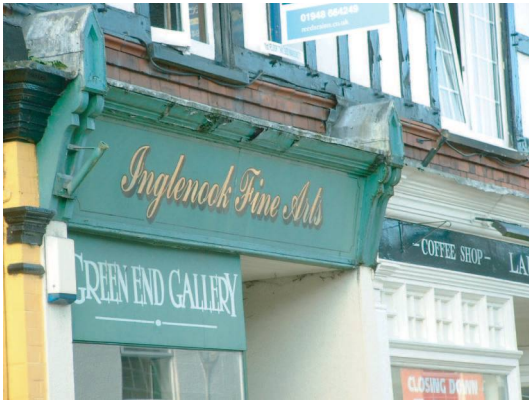
Picture 12 GOOD : Traditional fascia, with cornice above and small architrave below, enclosed with capitals and nicely proportioned sign