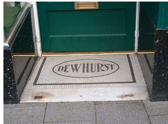
Picture 21 GOOD : Surviving mid 20th Century advertising mosaic in a doorway