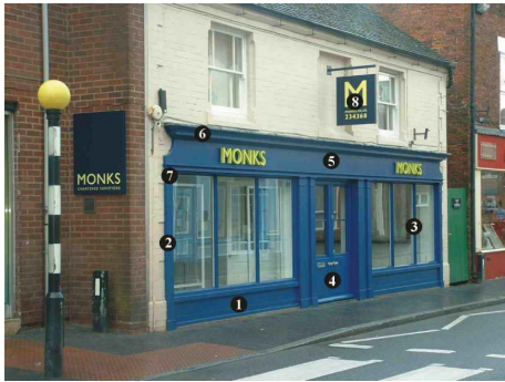
Picture 9 GOOD : Example of simple mullions used to reduce a large area of glass