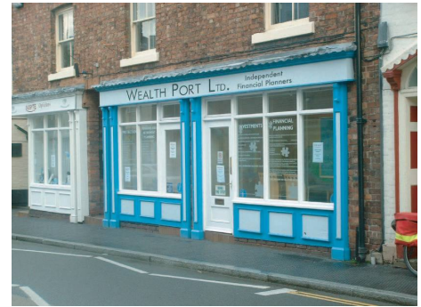
Picture 10 GOOD : Example of the use of high level transom to create to allow ventilation