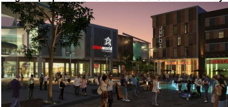
Image of proposed Cinema and Hotel Southwater Way

The mixed use development of a Cineworld, Premier Inn and seven restaurants started on site in December 2012 and is planned for completion in February 2014.