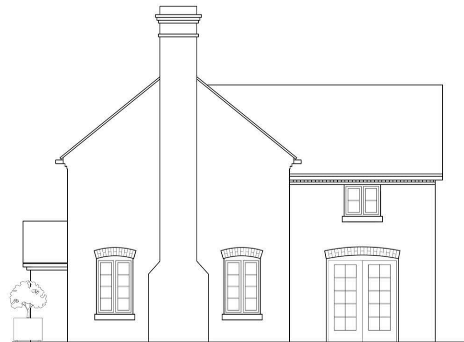
PROPOSED END ELEVATION