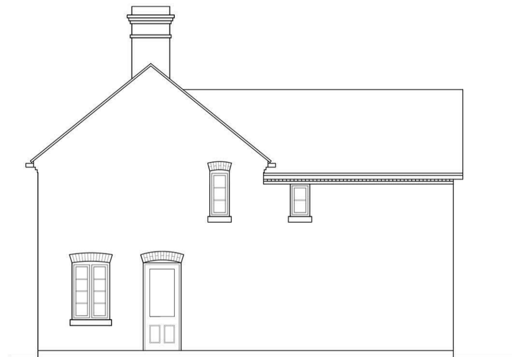
PROPOSED END ELEVATION