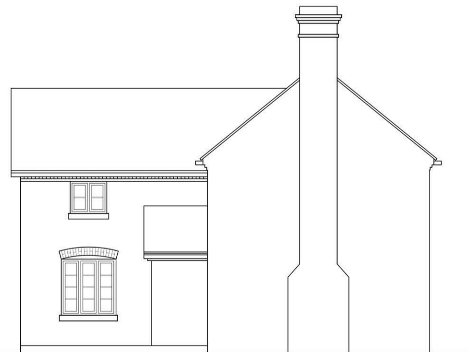
PROPOSED END ELEVATION