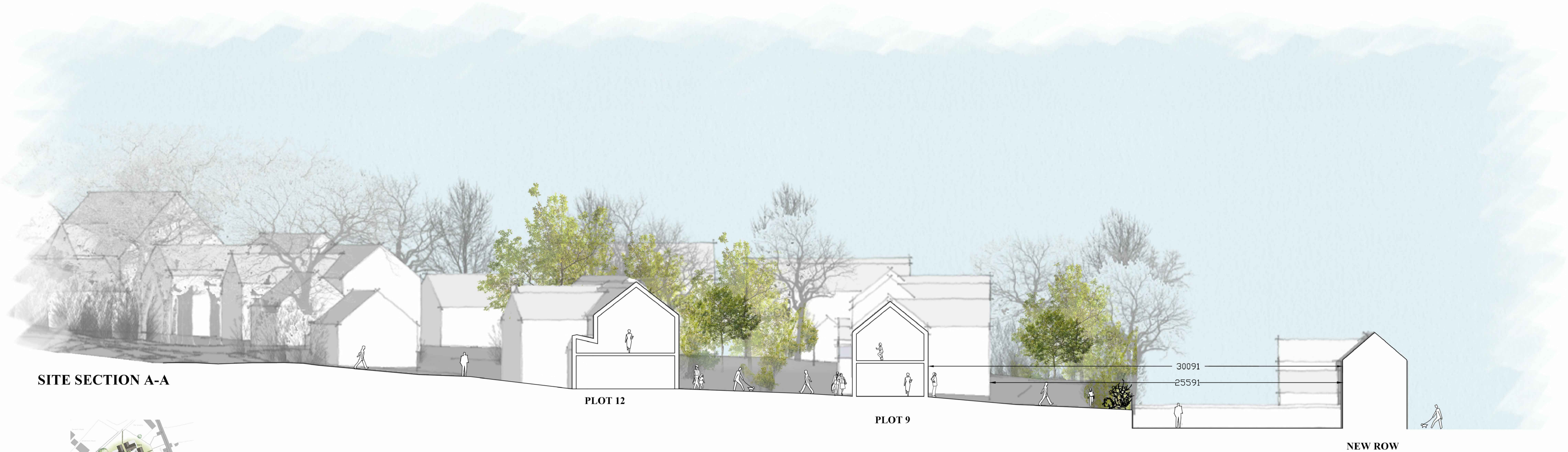
SITE SECTION A-A