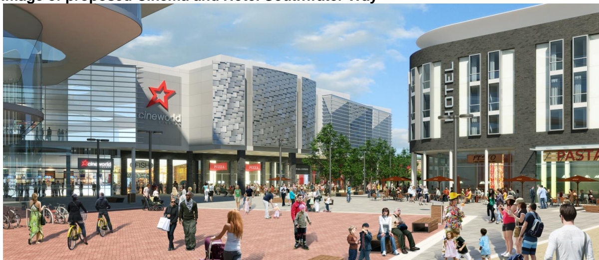
Image of proposed Cinema and Hotel Southwater Way

The regeneration of our Borough Town and local centres is also a key priority and these are being developed in partnership with local communities, businesses, Town and Parish Councils and our Regeneration Partnerships. The built environment continues to play an important role and whenever possible, property is used as a catalyst for change.