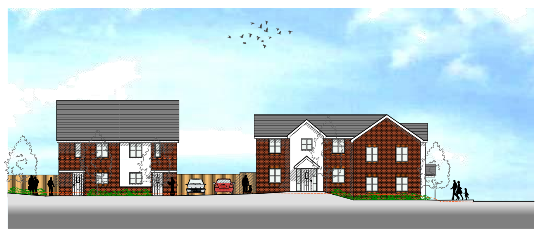
PLOT 01 3B5P Narrow House PLOT 02 3B5P Narrow House PLOT 03 2B4P Wide House PLOT 04 3B5P Wide Corner House Pool Hill Road