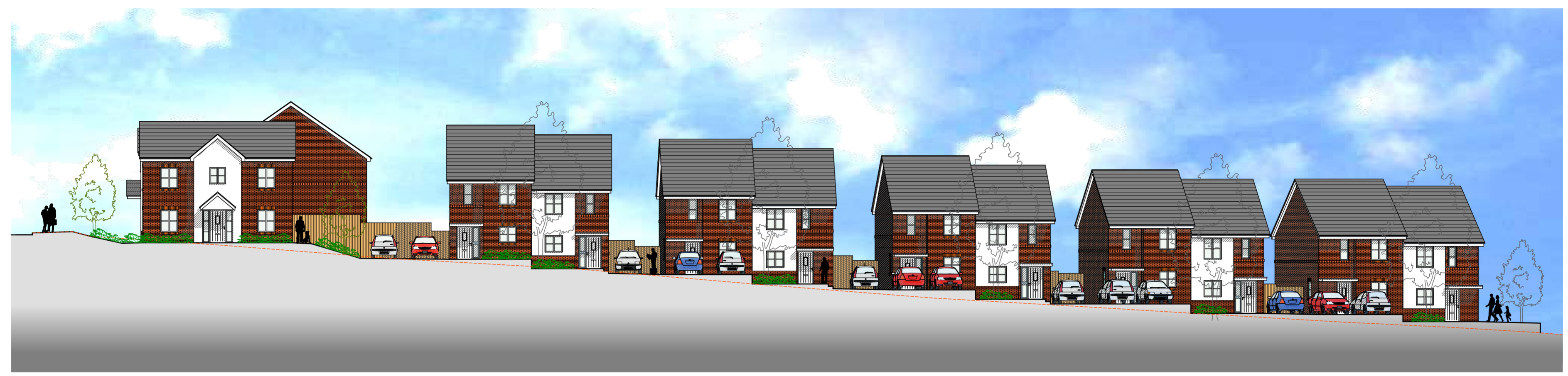
Station Road PLOT 04 3B5P Wide Corner House PLOT 05 2B4P Narrow House PLOT 06 2B4P Narrow House PLOT 07 3B5P Narrow House PLOT 08 3B5P Narrow House PLOT 09 2B4P Narrow House PLOT 10 2B4P Narrow House PLOT 11 2B4P Narrow House PLOT 12 2B4P Narrow House PLOT 13 3B5P Narrow House PLOT 14 3B5P Narrow House