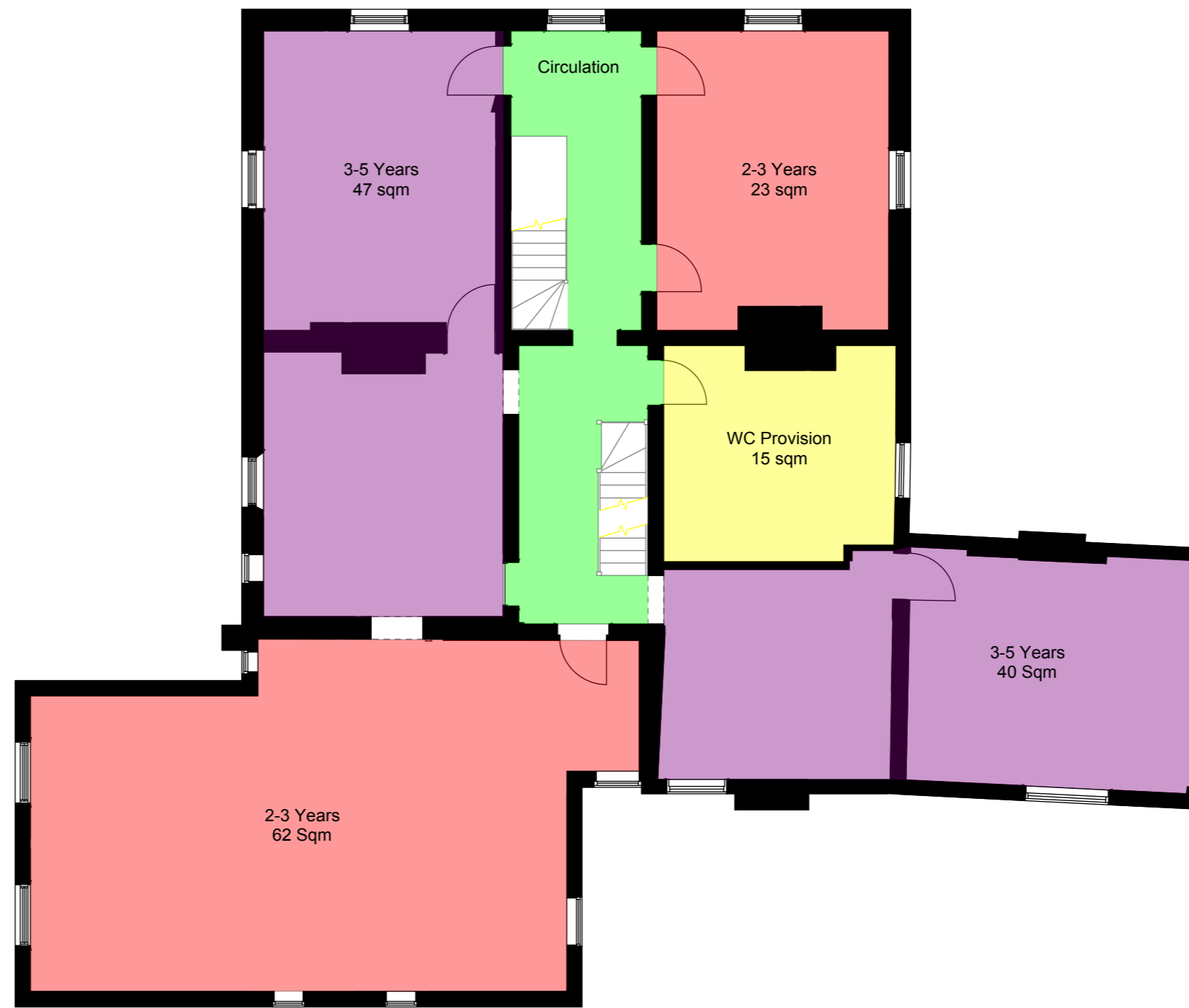
First Floor Proposed Plan 1:100