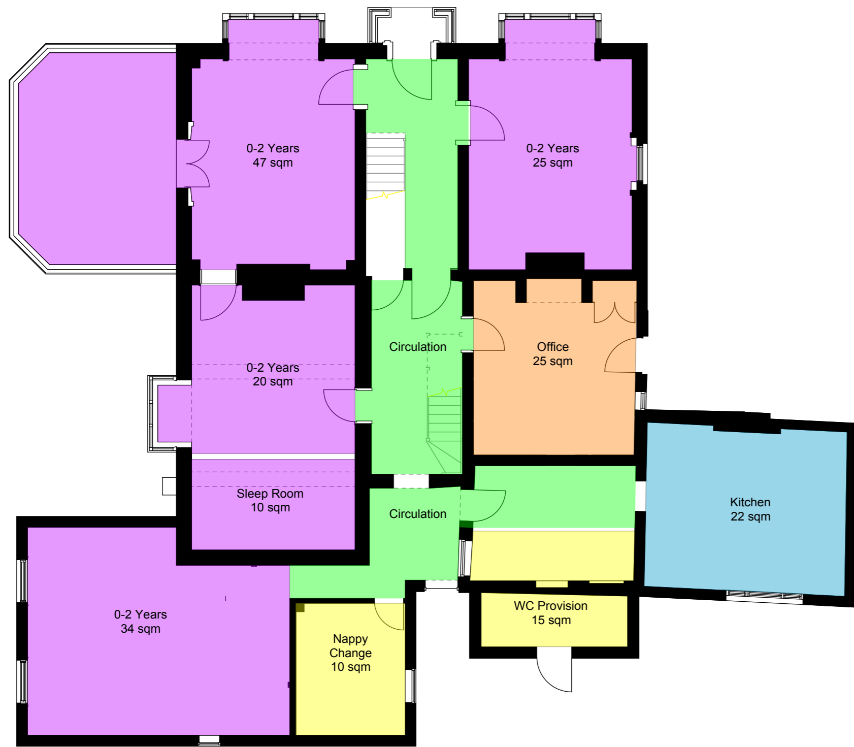
Ground Floor Proposed Plan 1:100