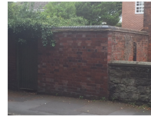
Existing Brick Wall