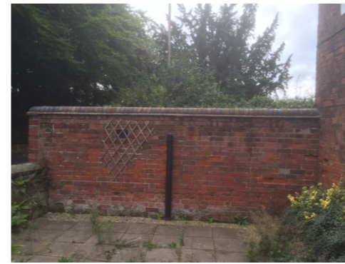
Existing Brick Wall