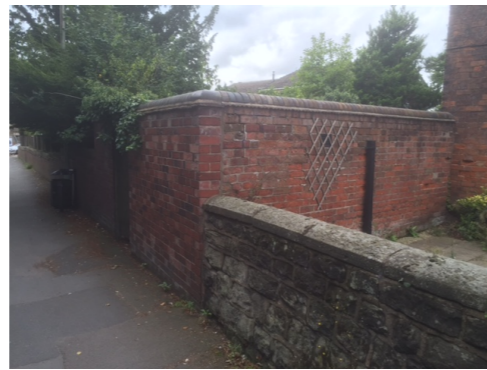
Existing Brick Wall