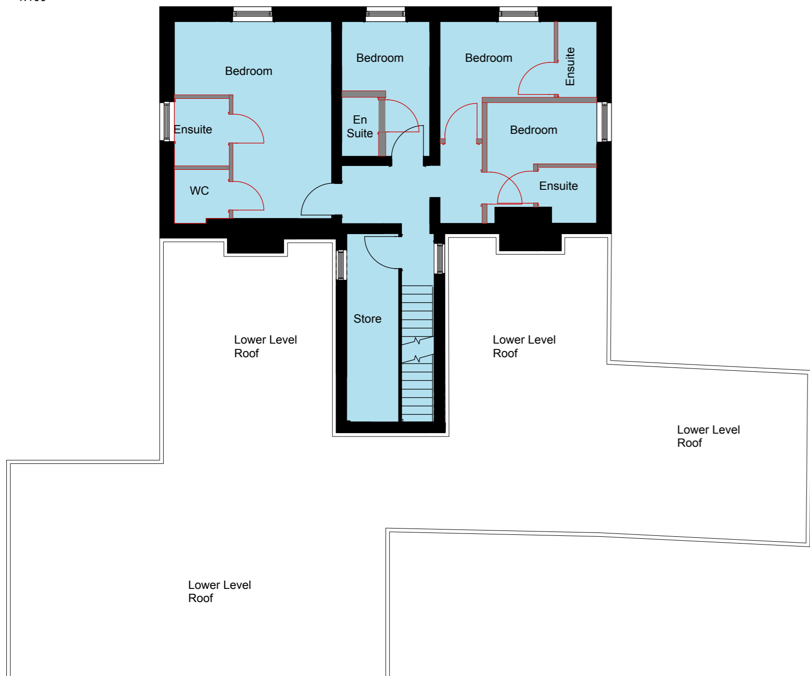
Second Floor Demolition Plan 1:100