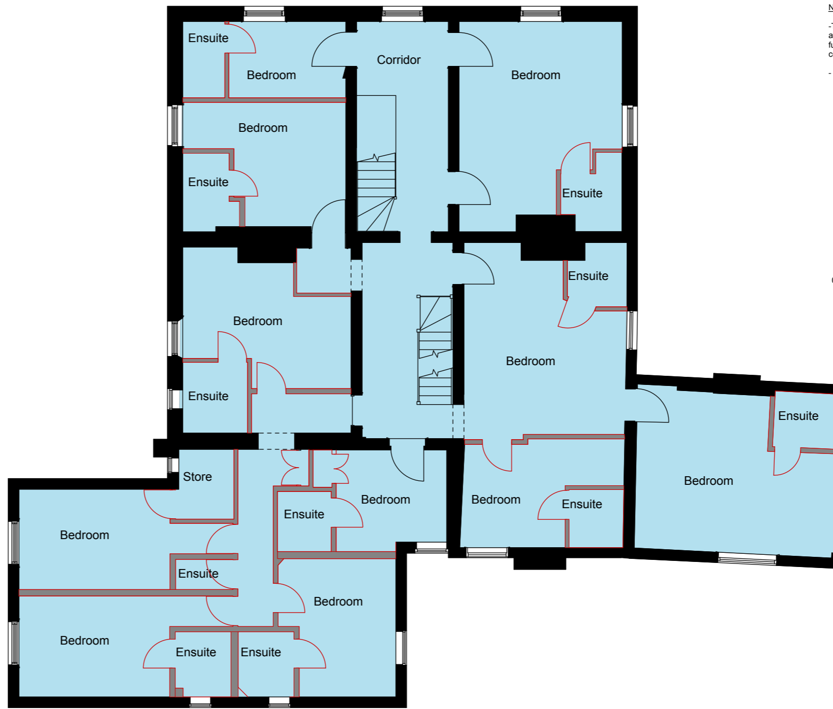
First Floor Demolition Plan 1:100