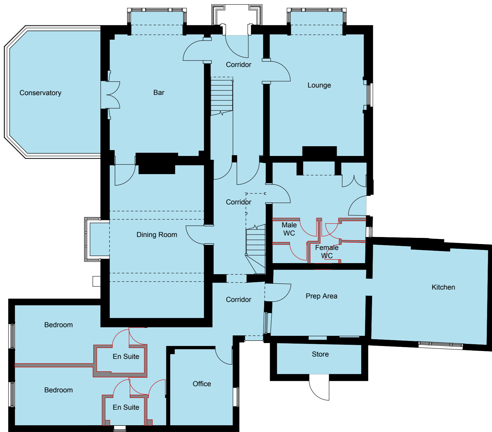
Ground Floor Demolition Plan 1:100