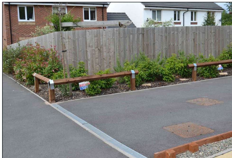
Photo of Diamond Rail barrier rair to rear of 7 Cloisters Way.

ALL ELEVATIONS ARE VIEWED FROM OUTSIDE UNLESS OTHERWISE STATED.