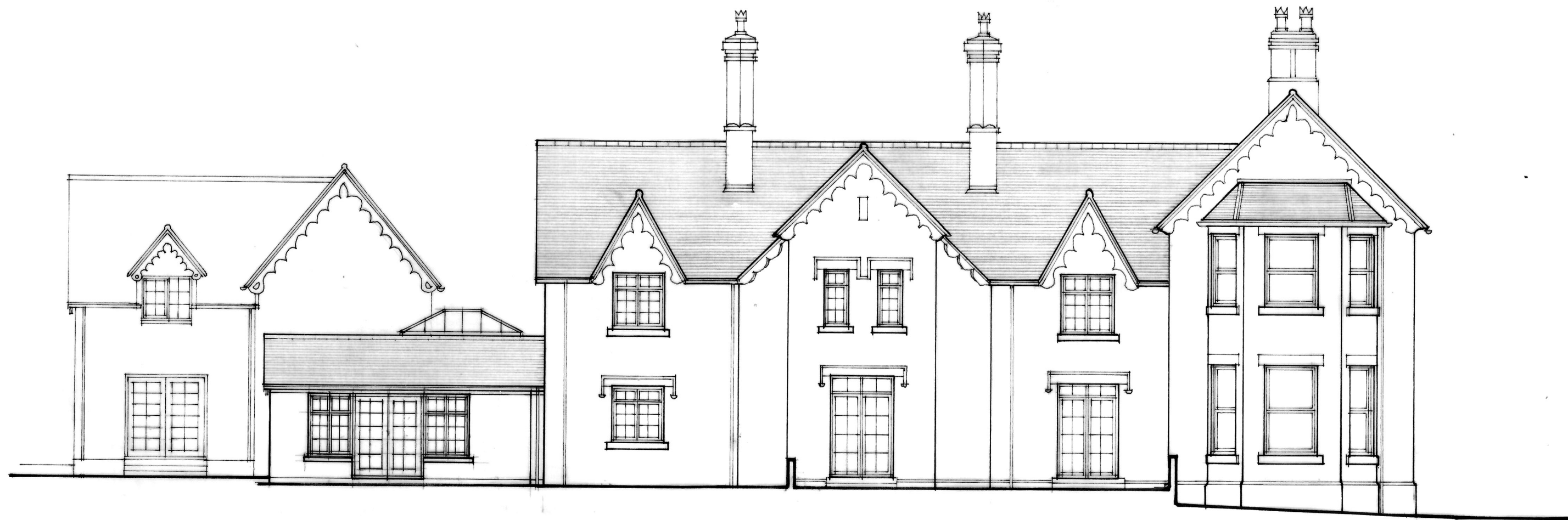
SW. ELEVATION (REAR)