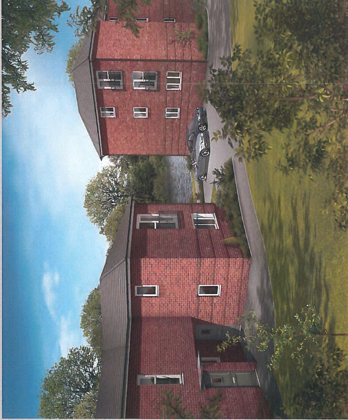
Computer Generated Artists Impression

Trinity Wharf is the perfect location for savvy professionals seeking city-centre style and access without the expense of a B1 postcode.