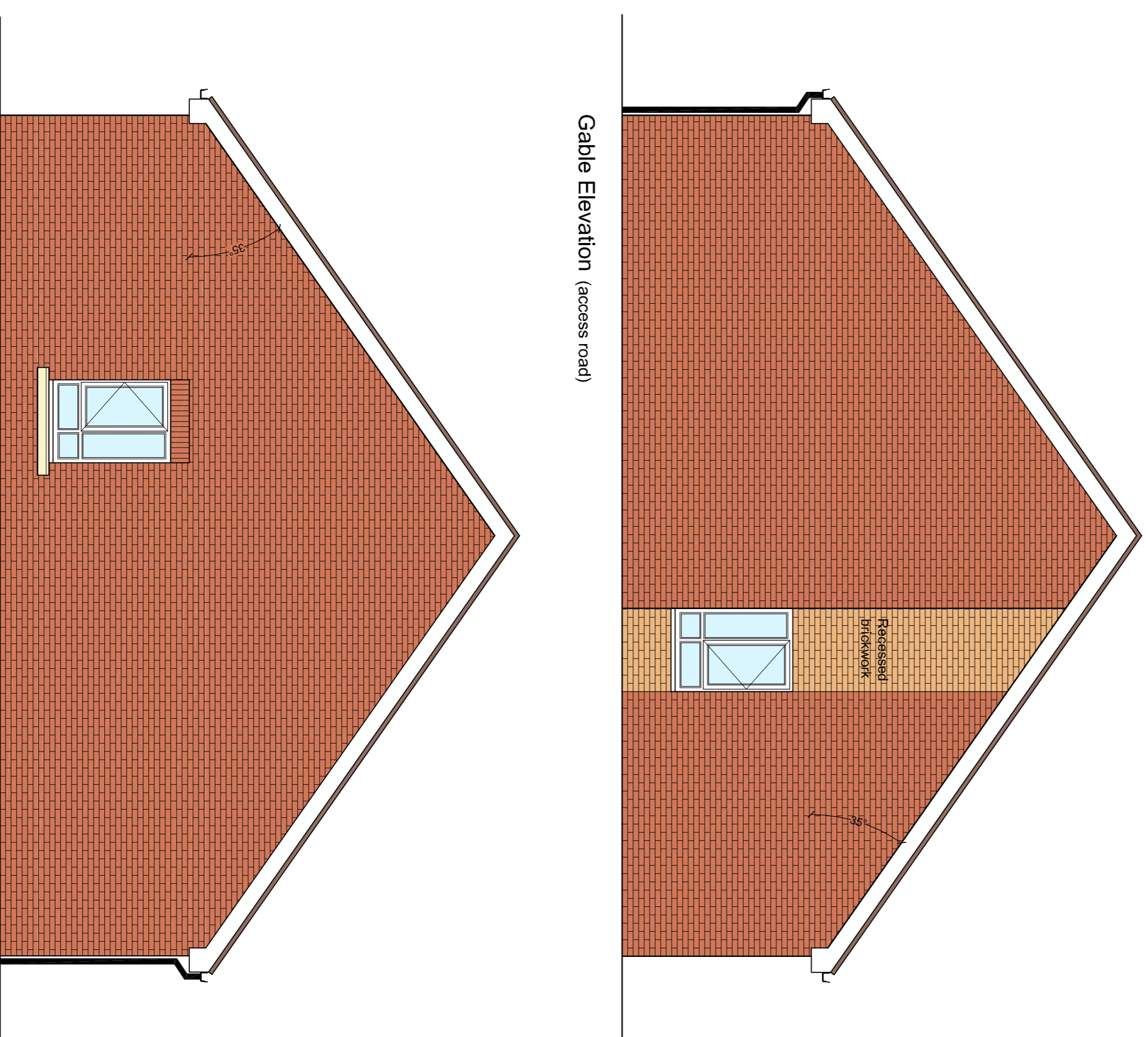
Gable Elevation (access road)