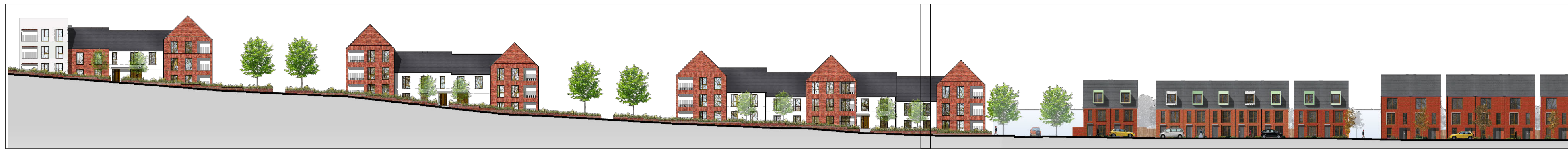
Streetscene AA (1:500)