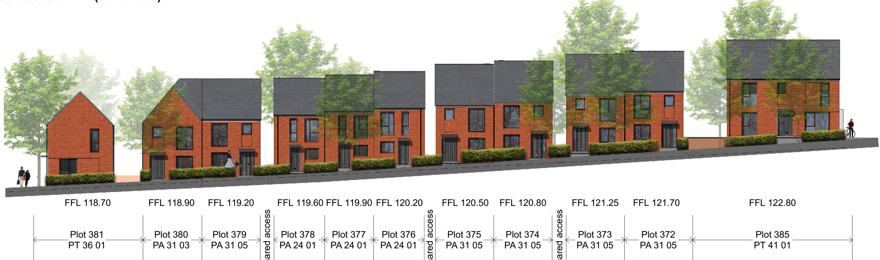
Streetscene B B