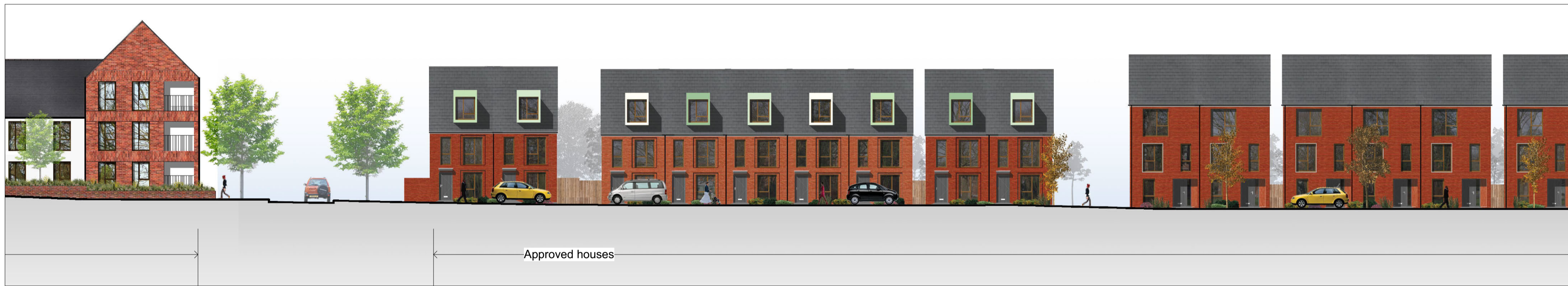
Streetscene AA (continued)