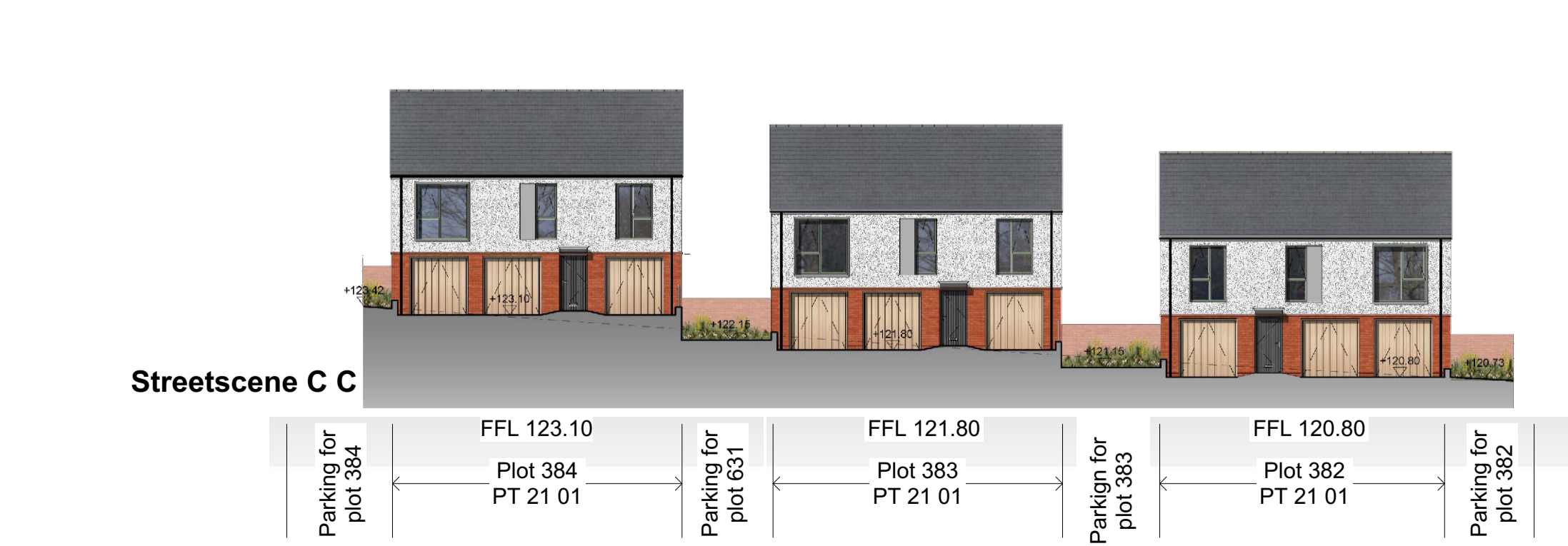
Streetscene C C