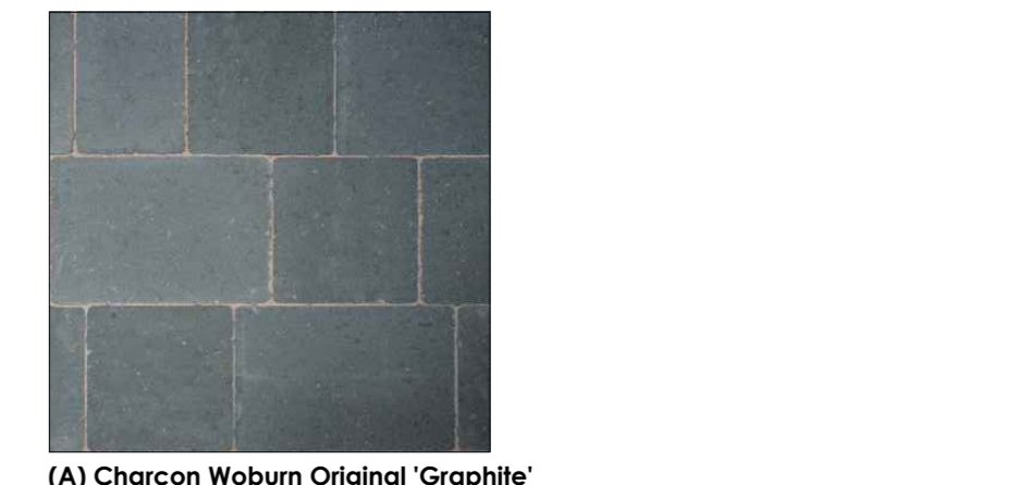
(A) Charcon Woburn Original 'Graphite'

Charcon's Woburn block paving (colour Graphite) will be used for the adoptable road surfaces other than where asphalt surfaces are proposed. This will provide a consistent road surface across the entire development, in keeping with the previous phase (Ecoville). This main surface will be edged with Charcon's Black Kerb (colour Grey) as previously approved.