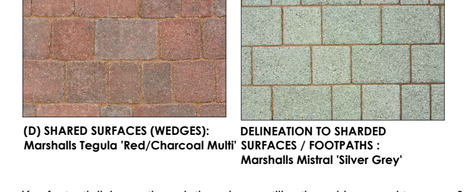
(D) SHARED SURFACES (WEDGES): Marshalls Tegula 'Red/Charcoal'