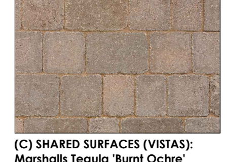
(C) SHARED SURFACES (VISTAS): Marshalls Tegula 'Burnt Ochre'