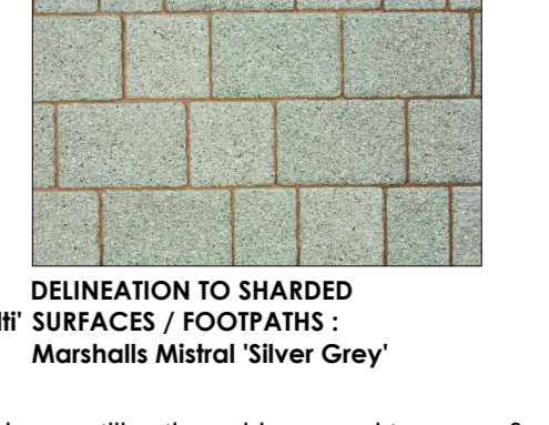
(E) SHARED SURFACES (WOODLAND VILLAS): Marshalls Mistral 'Silver Grey'

Key footpath linkages through the scheme utilize the golden gravel tar spray & chip surface previously used for footpaths at the perimeter of the site. This will provide clear legible routes through the development and open spaces areas whilst creating a consistent design approach for the entire site.