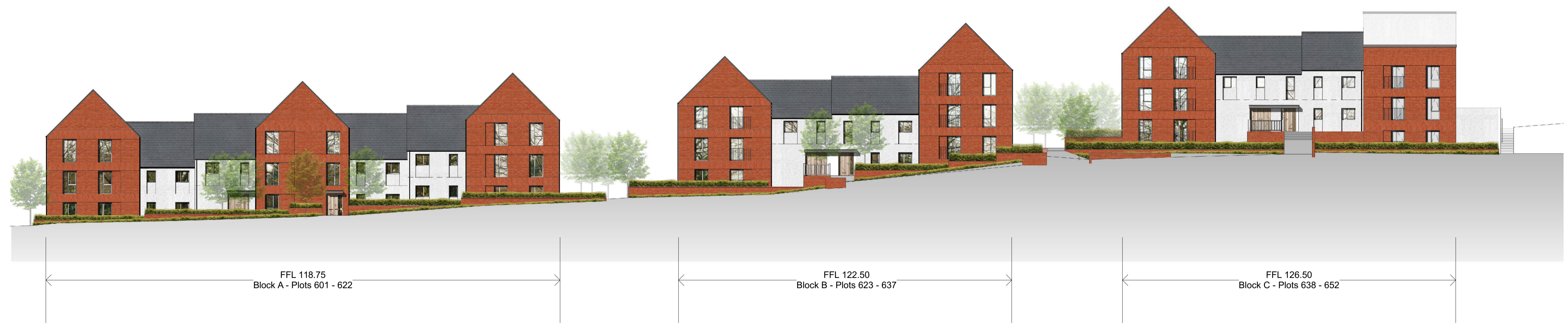
Streetscene D D