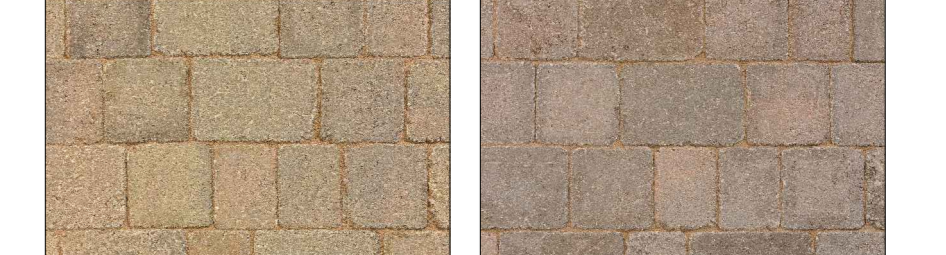
(B) SHARED SURFACES (ECOVILLE): Marshalls Tegula 'Harvest'

Shared surfaces throughout the scheme will be surfaced with Marshalls Tegula paving, consistent with the previous phases of the development. However each character area (Ecoville Homezone, Clearwater Wedges and Woodland Villas) will be identified with a different colour Tegula surface as detailed within the key. All shared surfaces will be edged with Marshalls Mistral (colour Silver Grey) set out and laid in accordance with the previous development area.