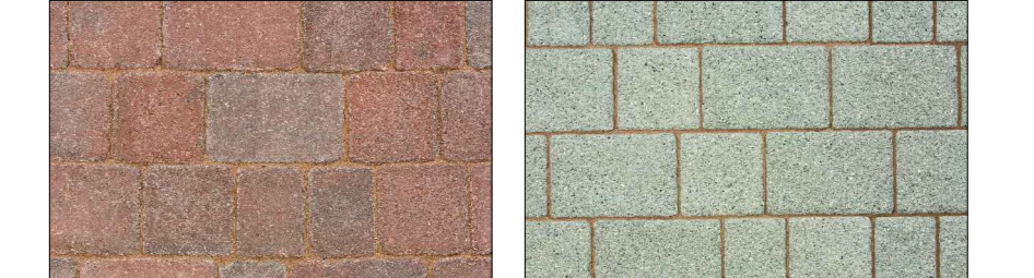
(D) SHARED SURFACES (WEDGES): Marshalls Tegula 'Red/Charcoal Mistral'