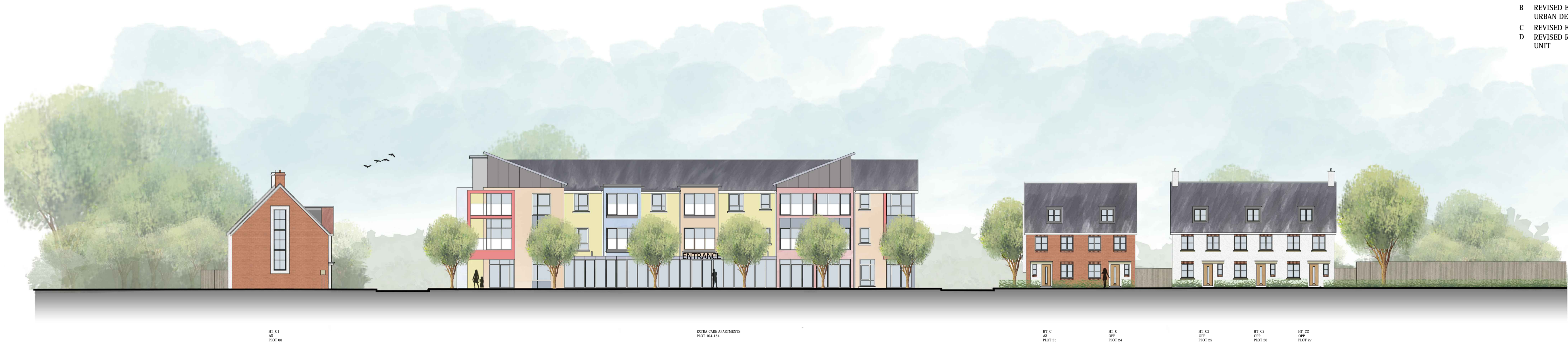
STREET SCENE A-A 0 5 10m