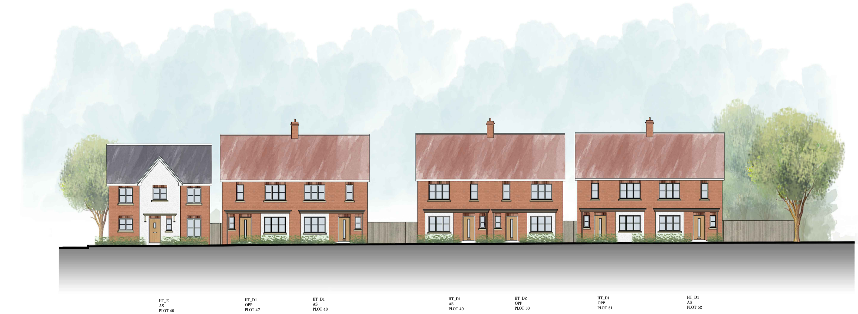
STREET SCENE B-B CONTINUED 0 5 10m