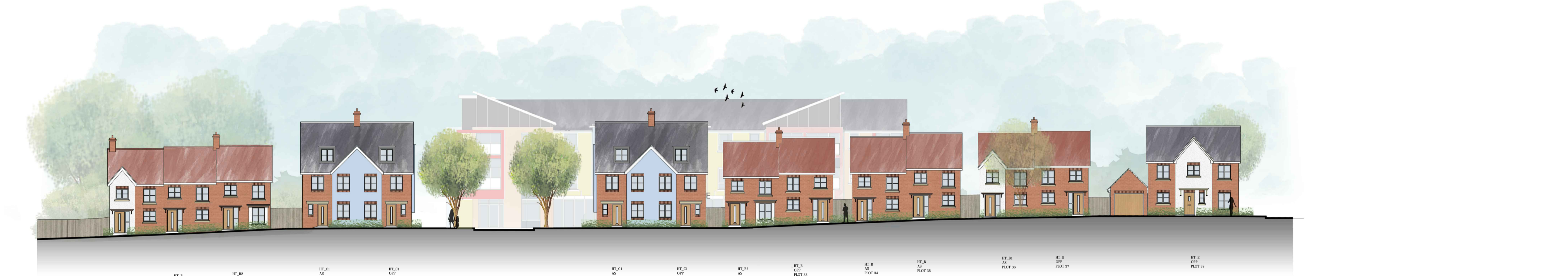
STREET SCENE B-B 0 5 10m