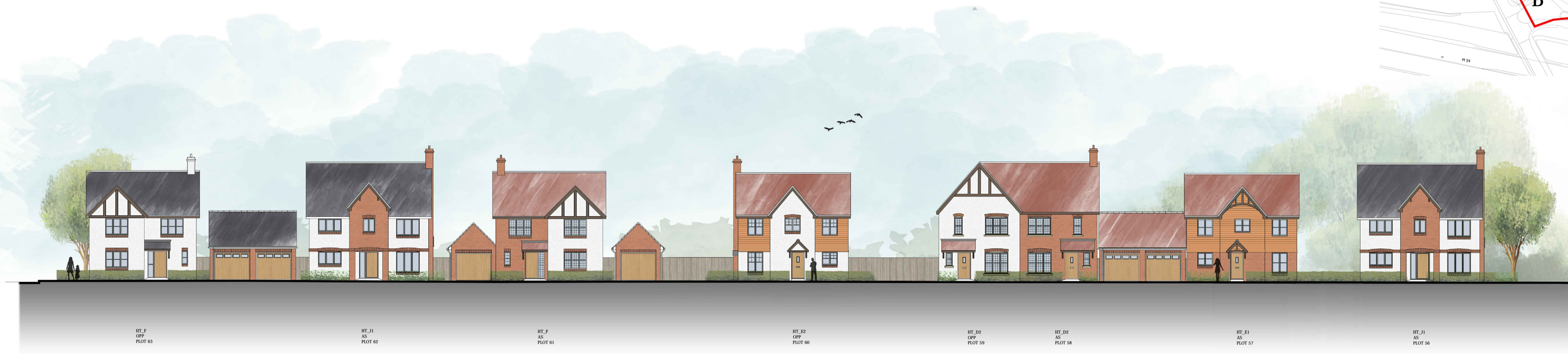
STREET SCENE C-C CONTINUED