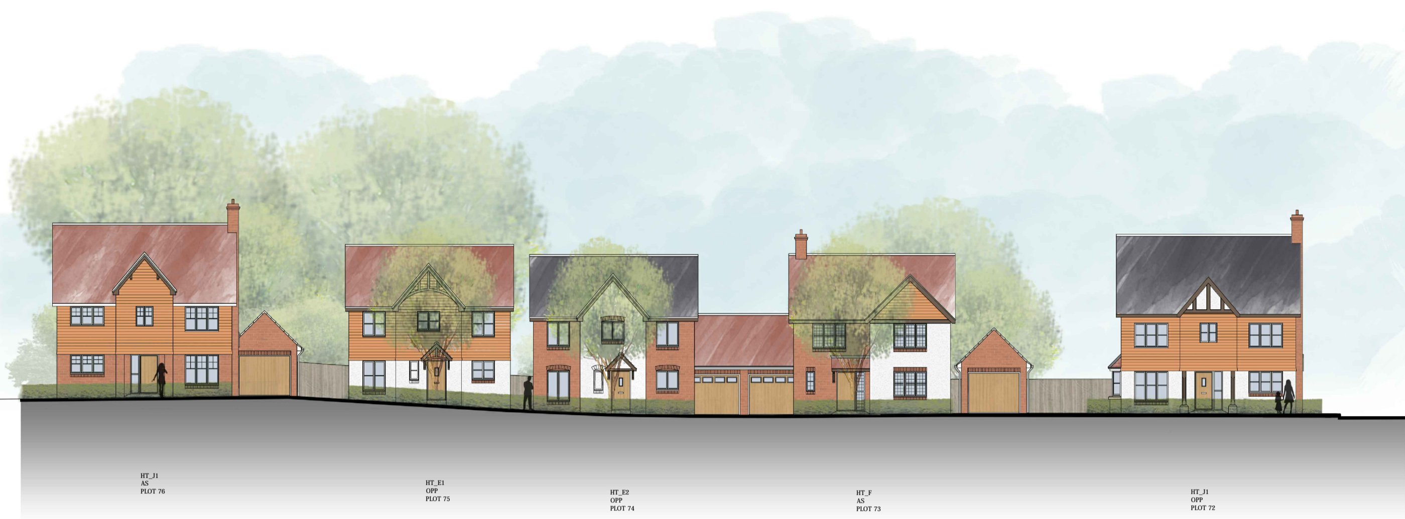
STREET SCENE C-C