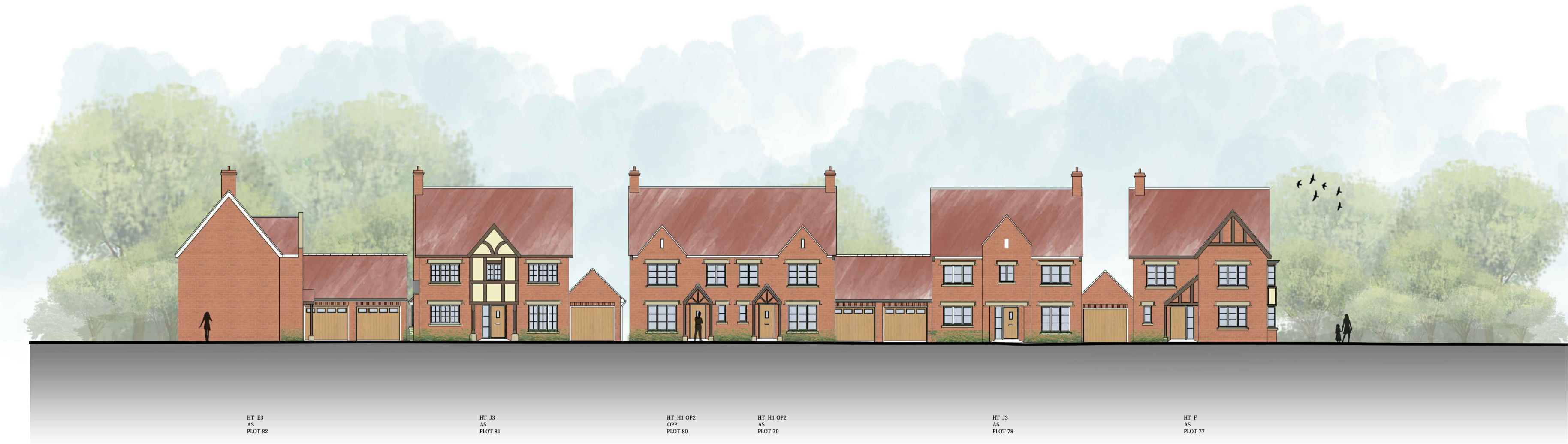
STREET SCENE D-D

Project LAND AT ARLESTON TELFORD Drawing Title STREET ELEVATIONS SHEET 2 OF 3 Date SEPT 2015 Scale 1:200@A1 Drawn by RO'R Check by CB Project No 25049 Drawing No SE-02 Revision C