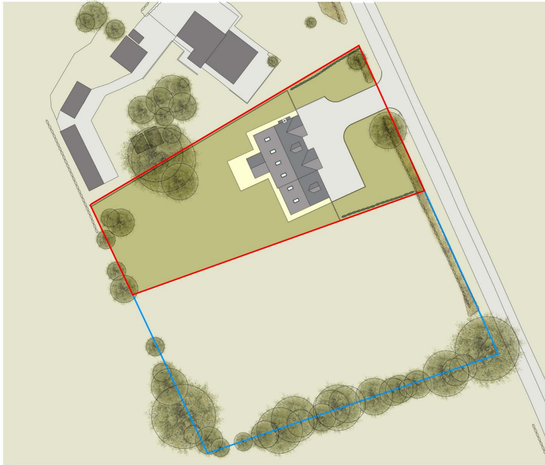
① SITE PLAN - 1:500@A3