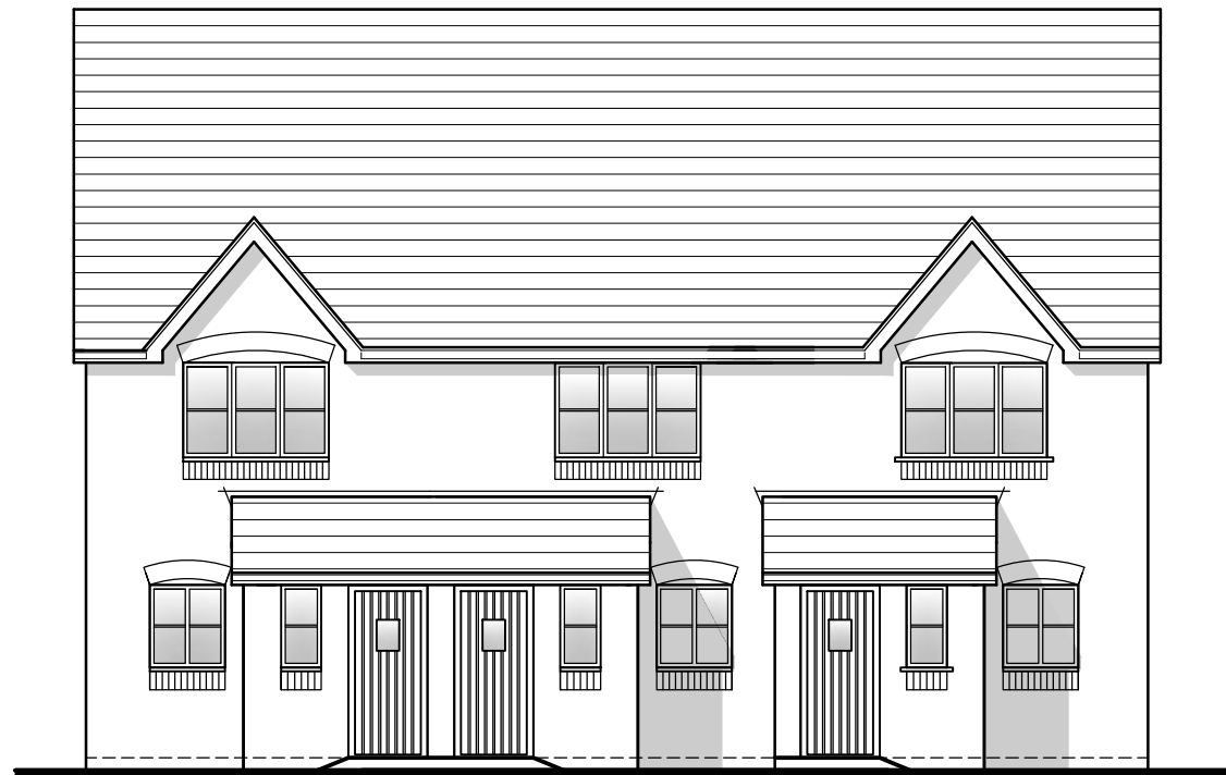
Plot 11 FRONT ELEVATION

Rev A 01.04.16 630mm wide windows added to lounge and bed 2 in side wall of plot 11 for surveillance purposes.