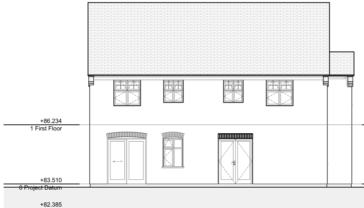
01-02 REAR ELEVATION 1:100