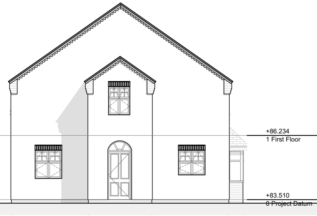
01-02 LEFT ELEVATION 1:100