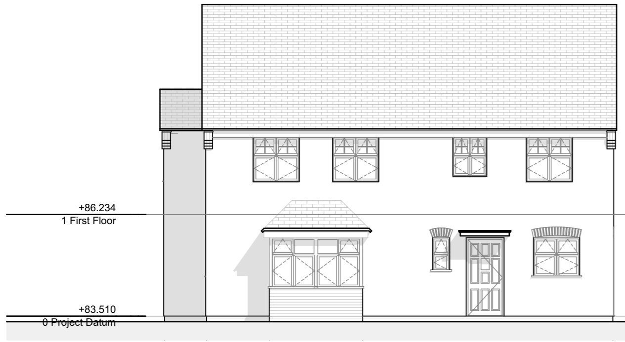
01-02 FRONT ELEVATION 1:100