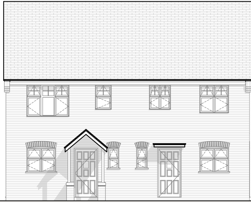
PLOTS 3, 4, 7, 8 FRONT ELEVATION