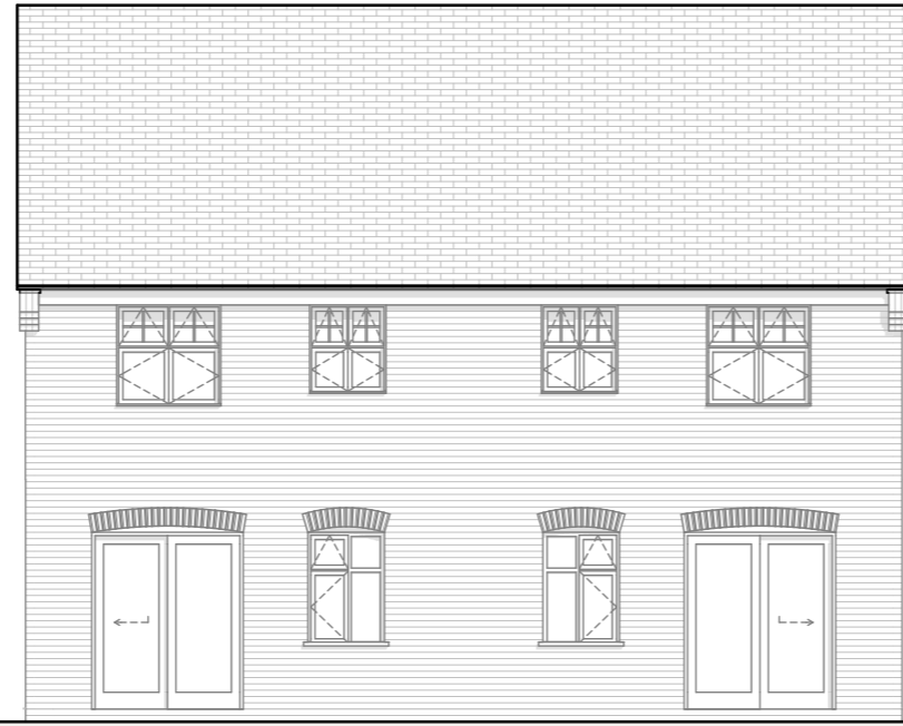
PLOTS 3, 4, 7, 8 REAR ELEVATION