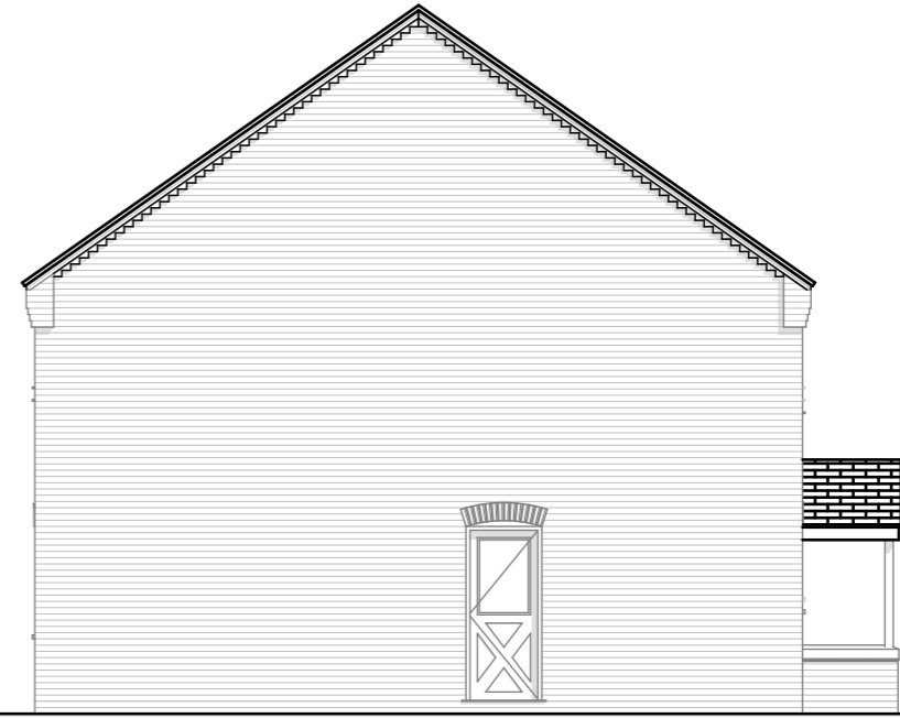
PLOTS 3, 4, 7, 8 LEFT ELEVATION