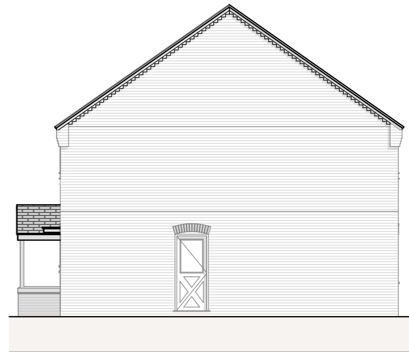
PLOTS 3, 4, 7, 8 RIGHT ELEVATION