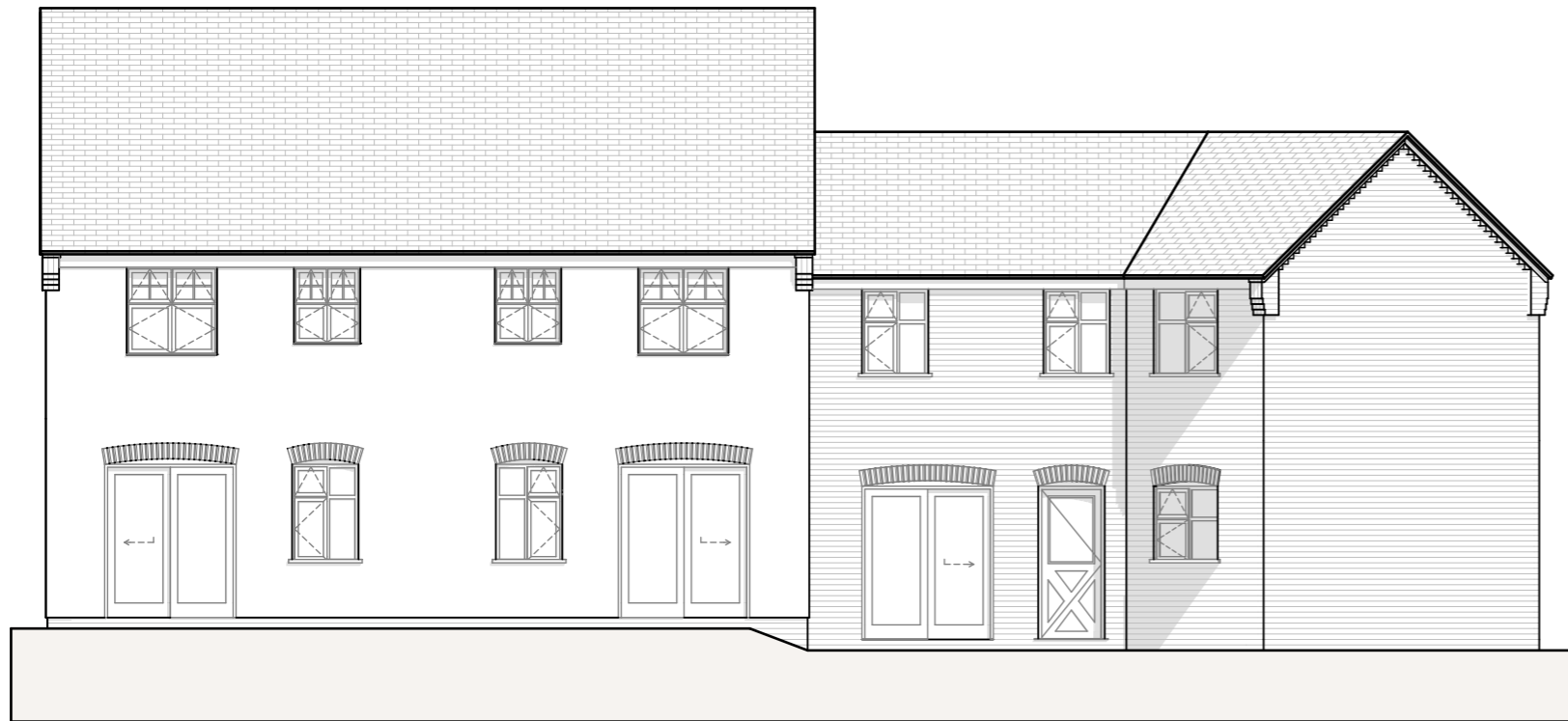
12-14 REAR ELEVATION 1:100