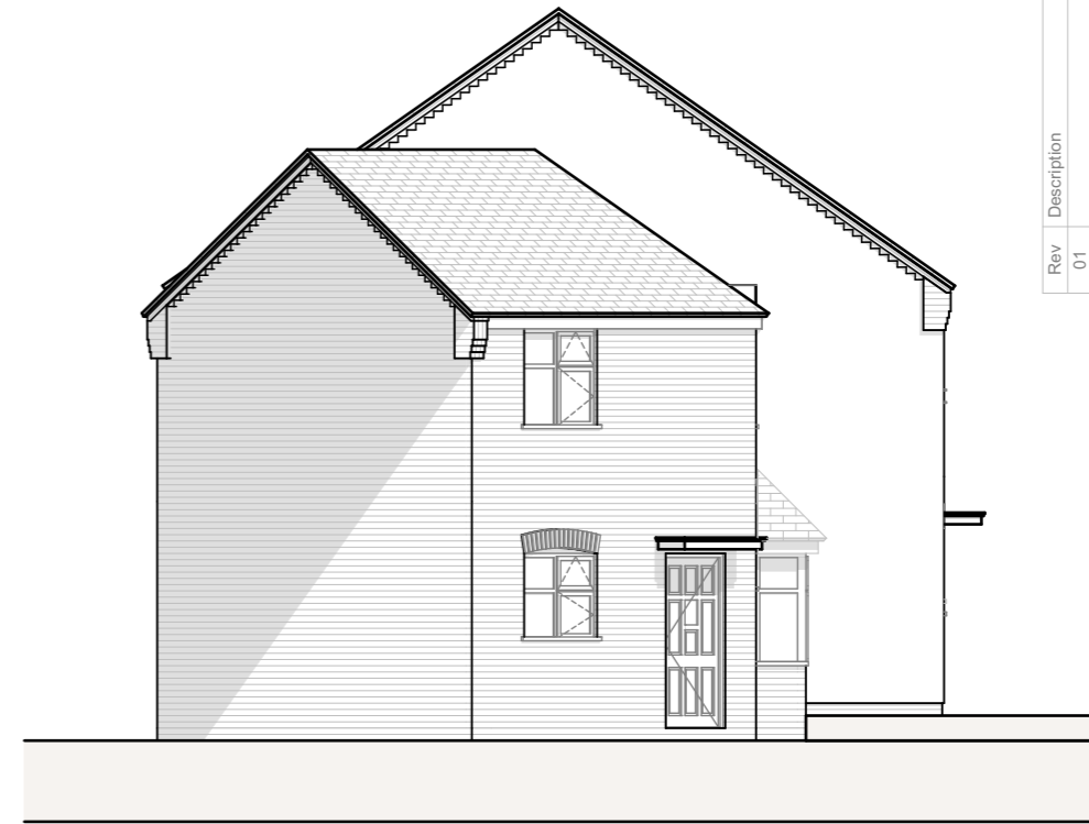
12-14 LEFT ELEVATION 1:100