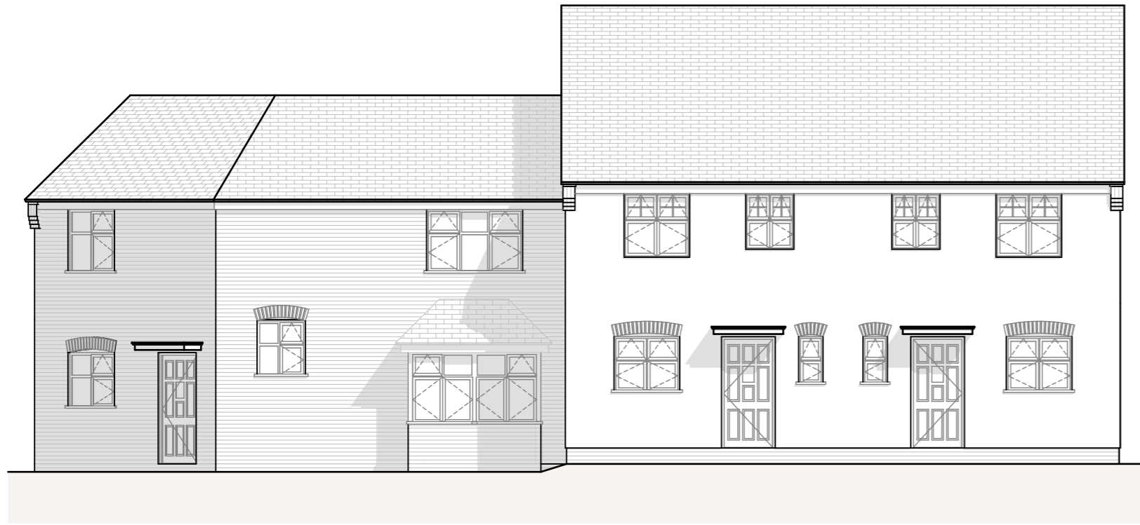
12-14 FRONT ELEVATION 1:100