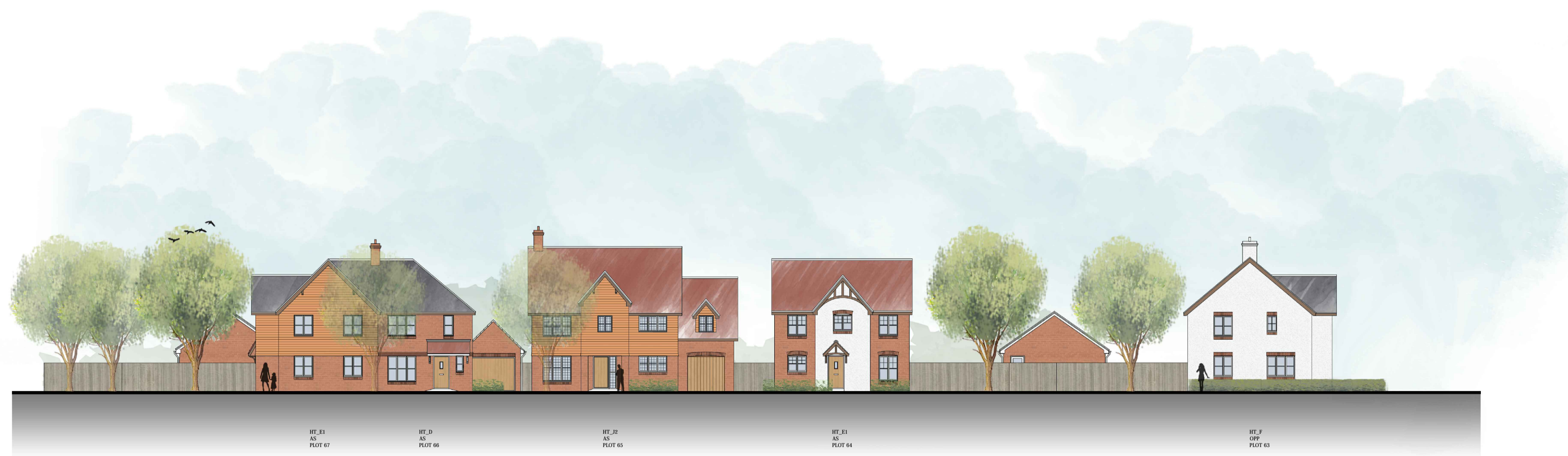
STREET SCENE E-E