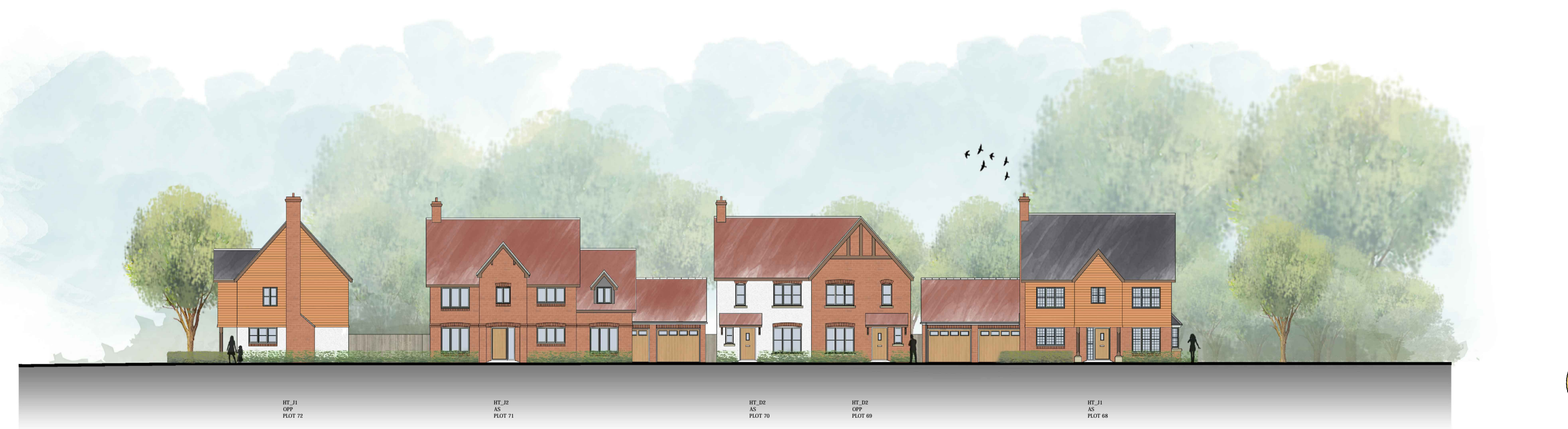
STREET SCENE F-F