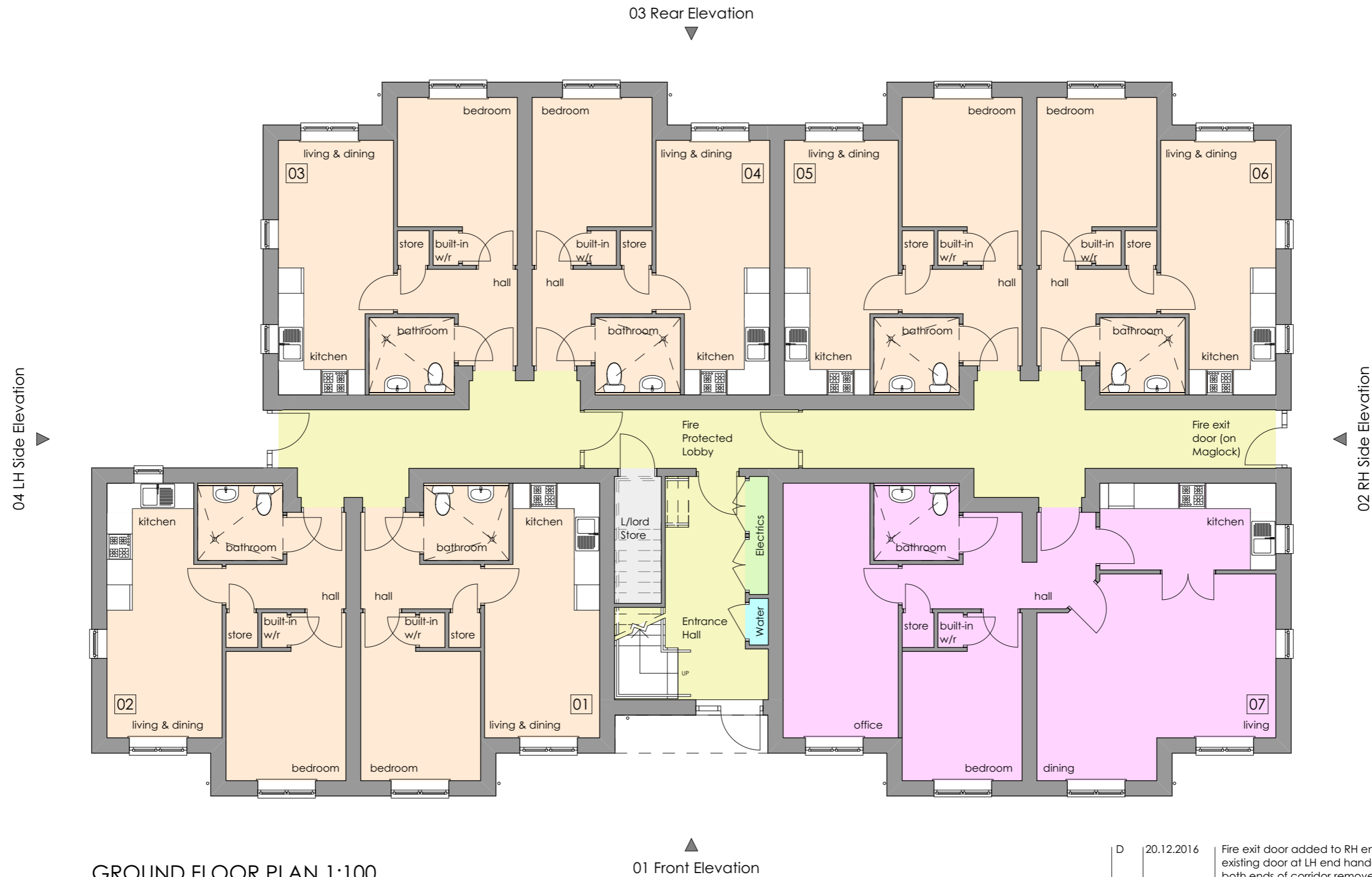
GROUND FLOOR PLAN 1:100 14+1 Units Block Gross Internal Floor Area (gr'nd floor) = 377.87m 2