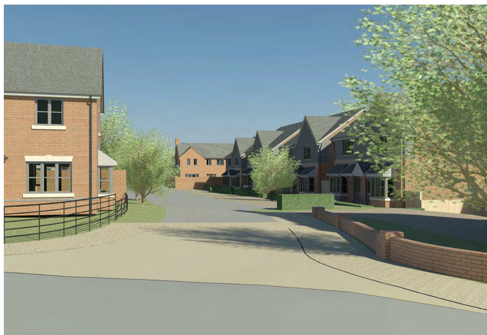
Camera 07: Street 6 looking north