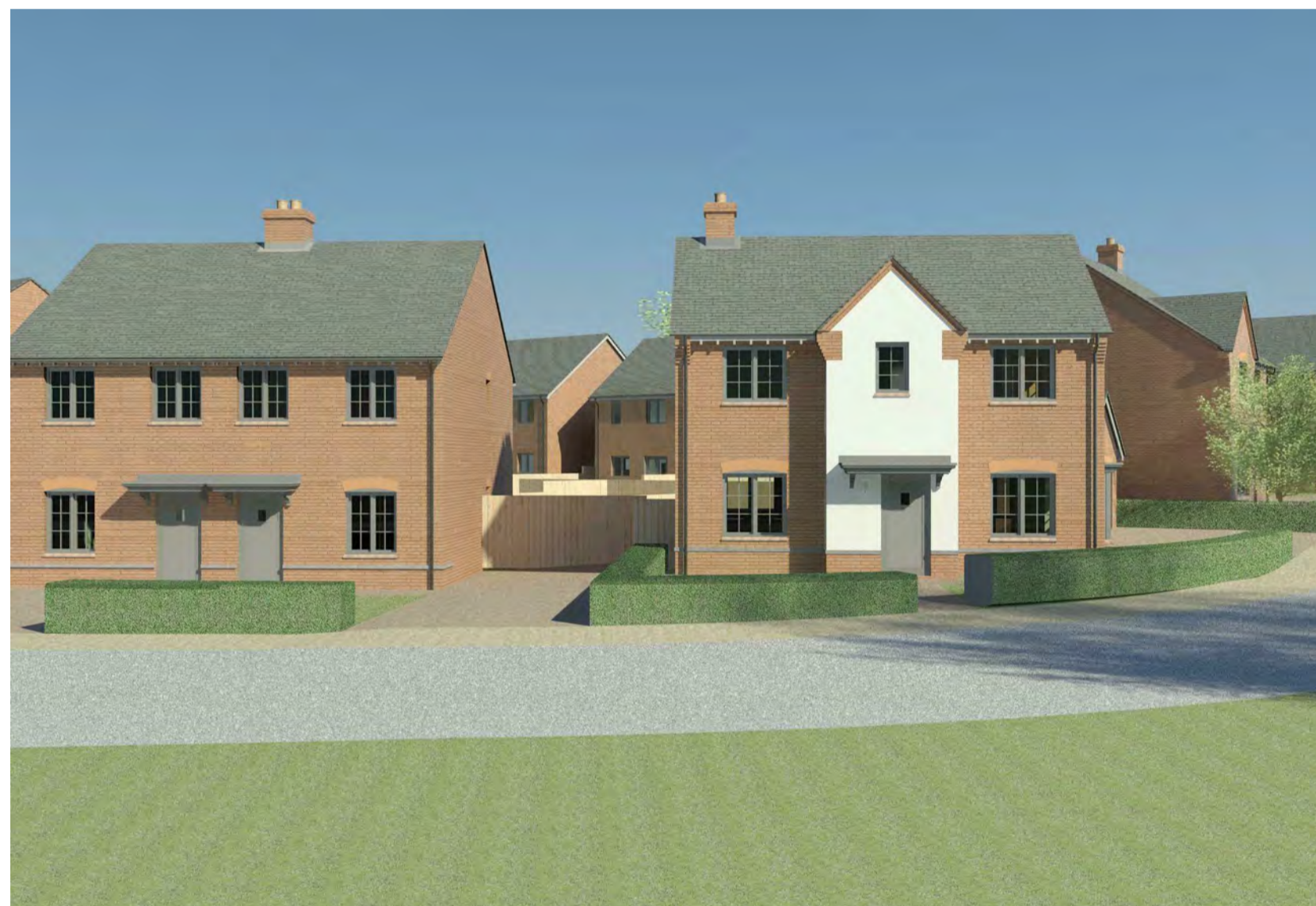
Camera 04: Junction street 2 street 3 looking south