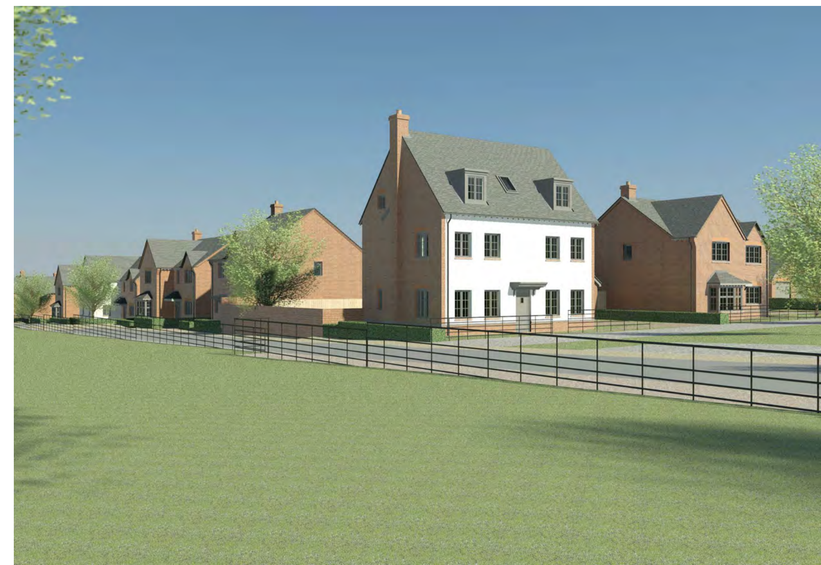
Camera 02: Street 2a buildings facing peregrine way. looking east