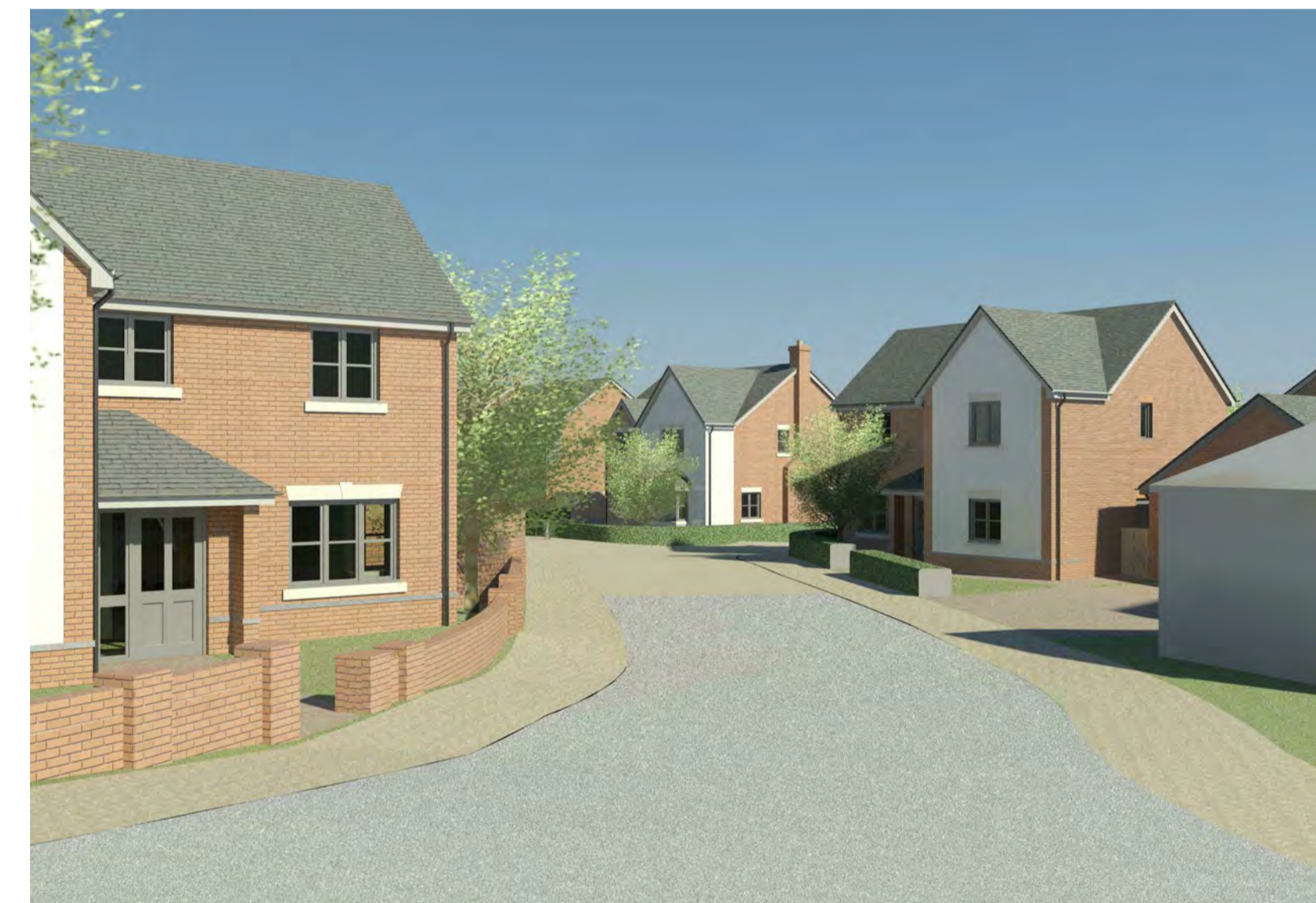
Camera 06: Street 4 street 5 junction looking north