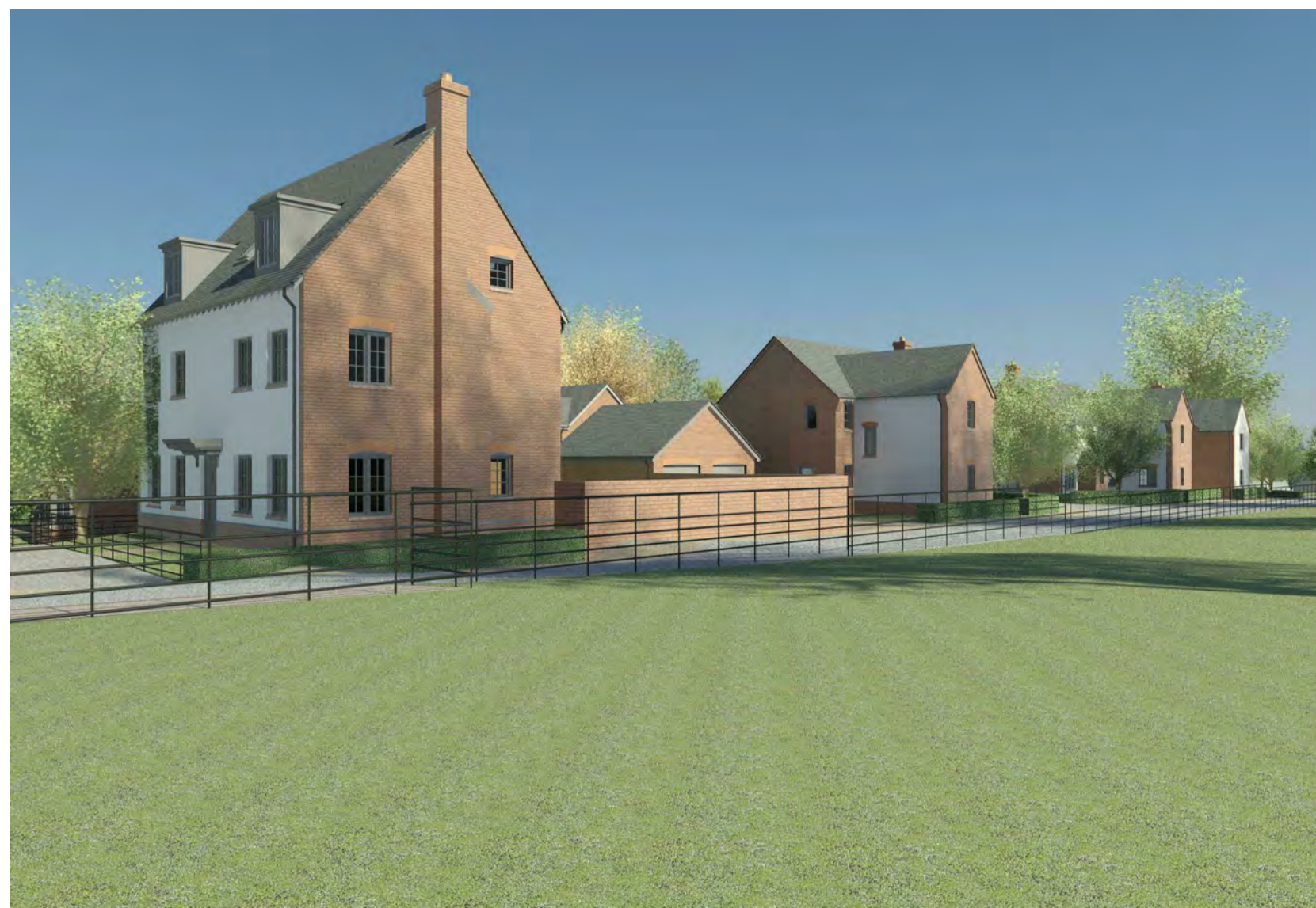
Camera 01: Street 1 & 1a junction looking north