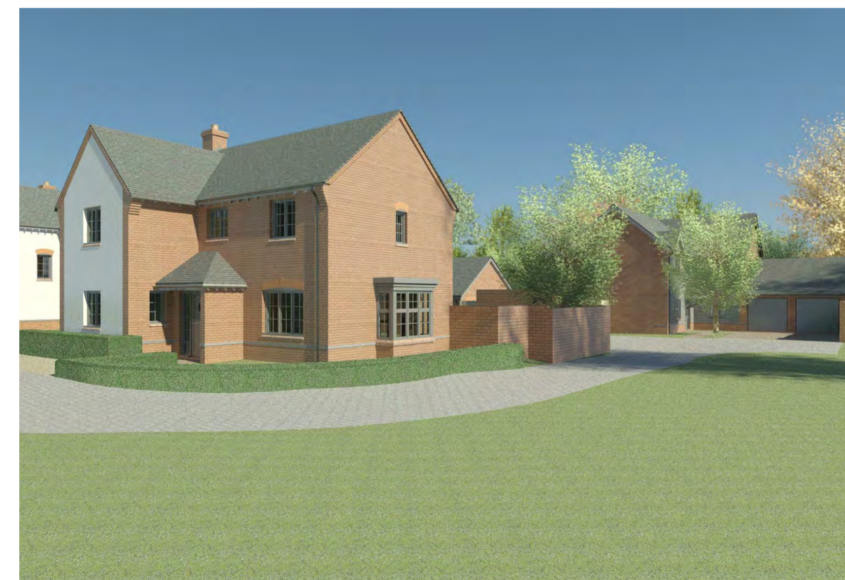
Camera 09: Street 1c looking west

Responsibility is not accepted for errors made by others in scaling from this drawing. All construction information should be taken from figured dimensions only.