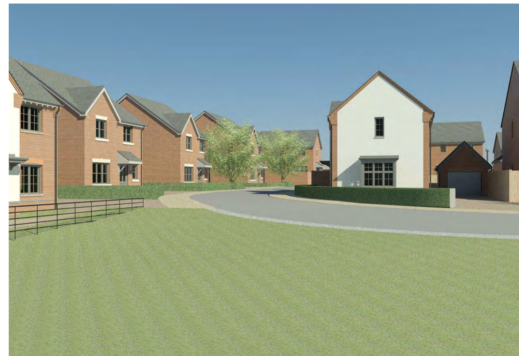
Camera 05: Street 3 street 4 junction looking southwest