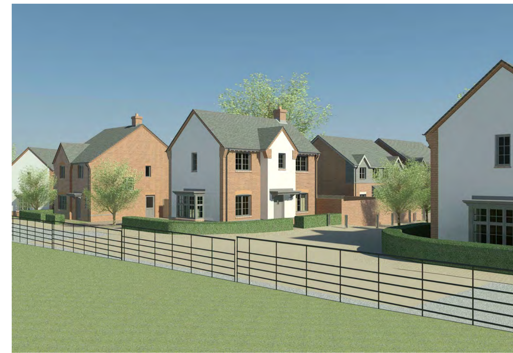
Camera 03: Street 2 street 3 junction. looking east