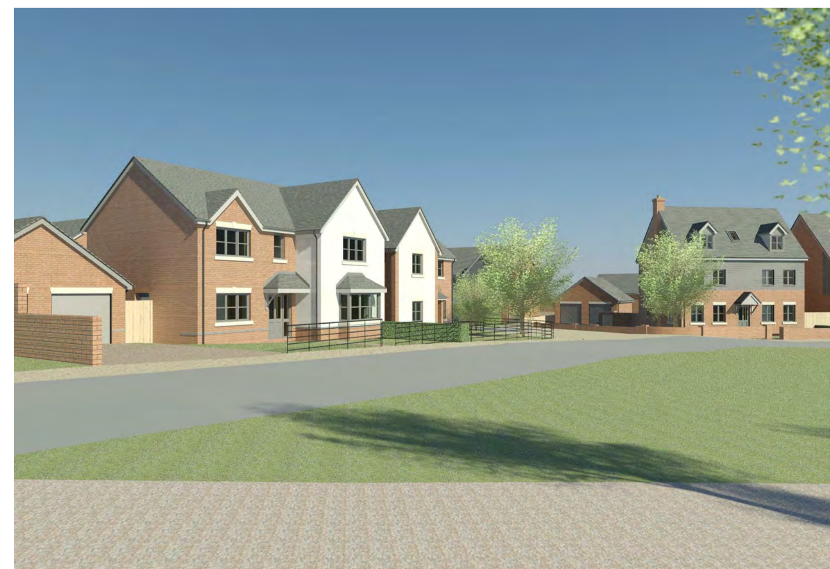
Camera 08: Peregrine way looking northeast