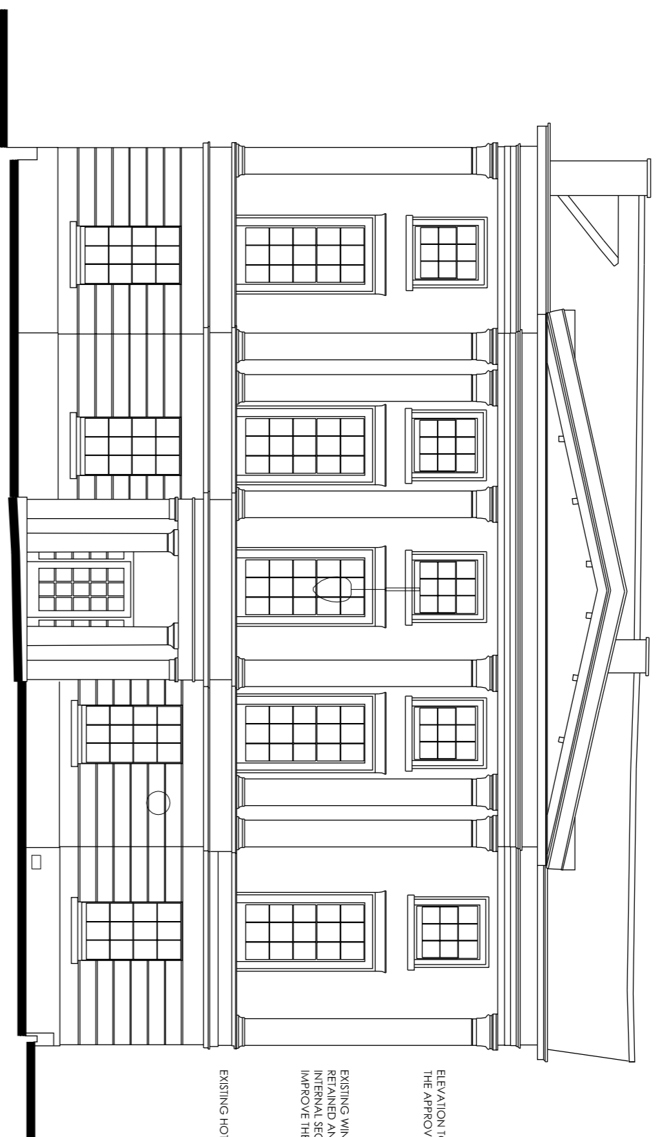
South West (front) Elevation facing St. Mary's Street