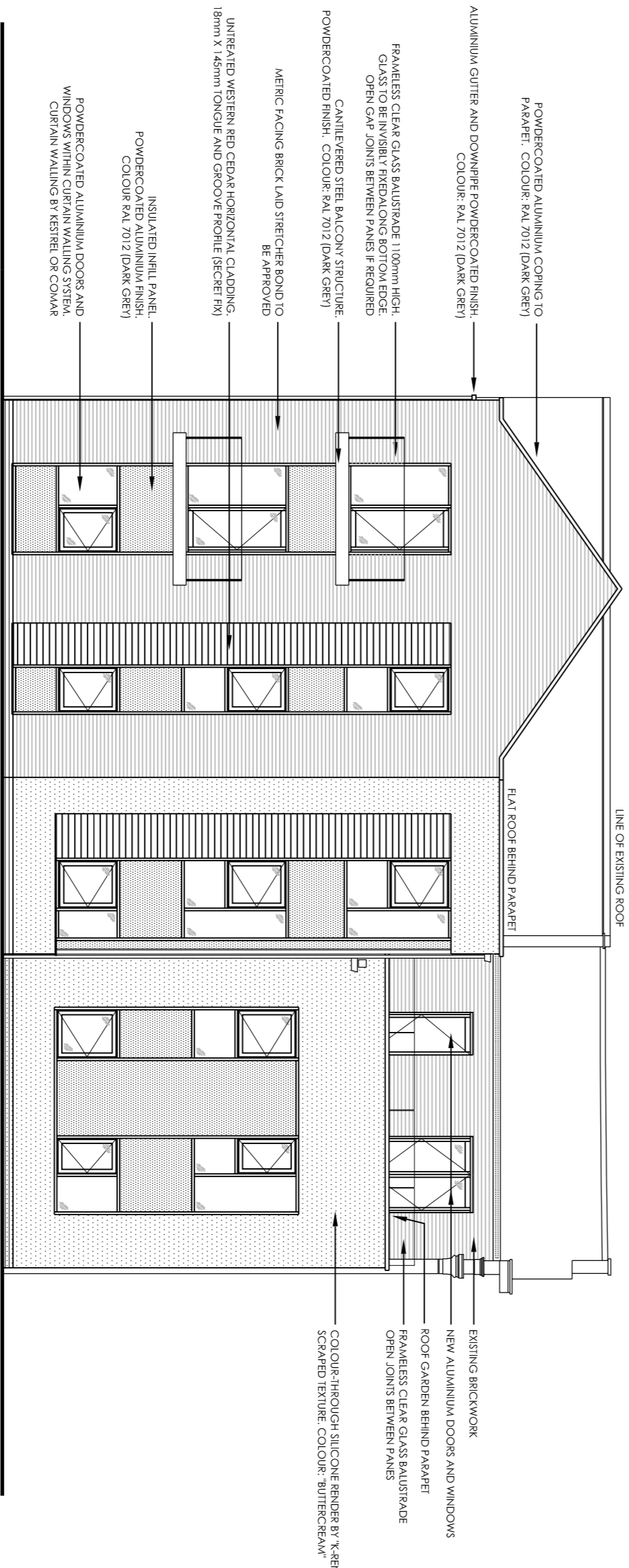
North East (rear) Elevation facing Water Lane