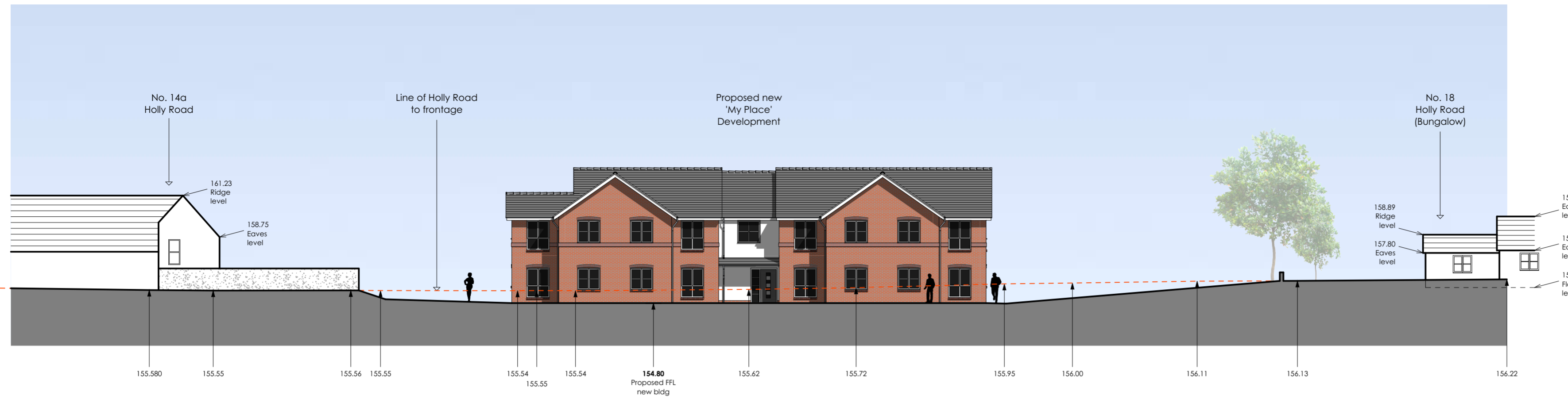
CONTEXTUAL FRONT ELEVATION FACING HOLLY ROAD