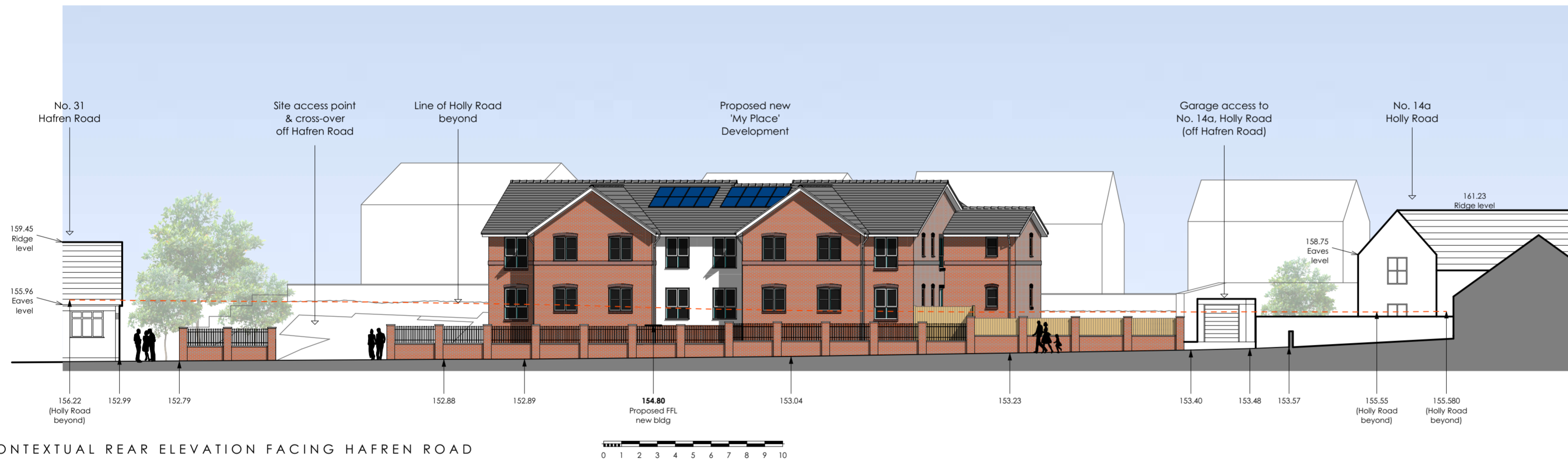
CONTEXTUAL REAR ELEVATION FACING HAFREN ROAD