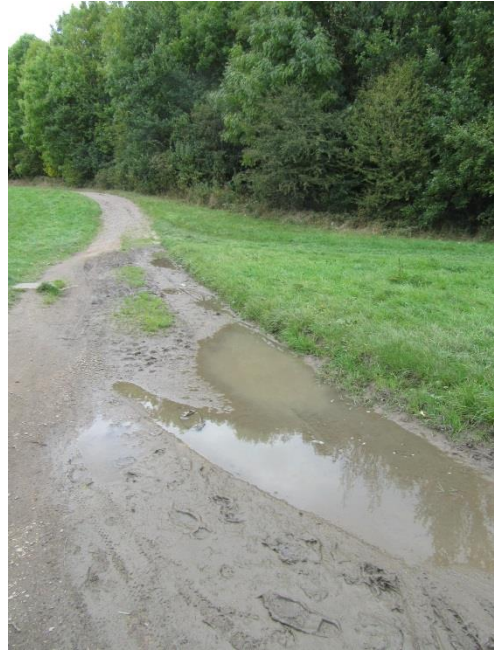
Rough Park Way