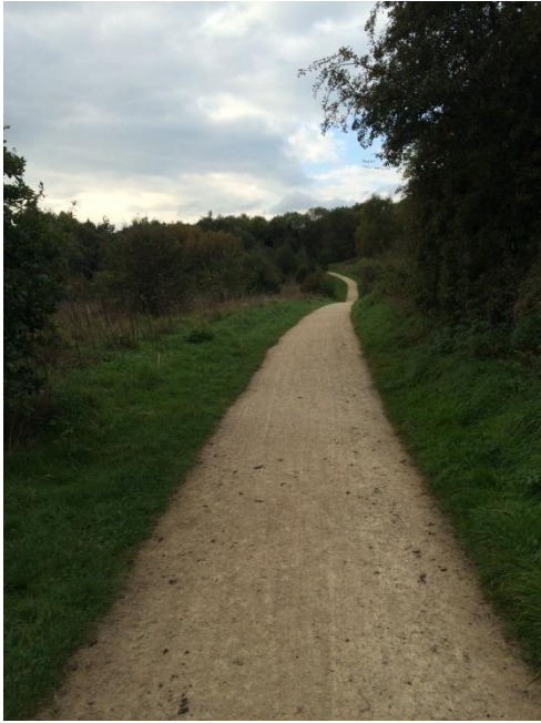
Silkin Way, South of Telford Town Park

Evidence of these findings can be seen through the following images: