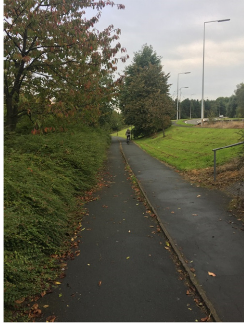
Off-road walking and cycling route adjacent to the M54