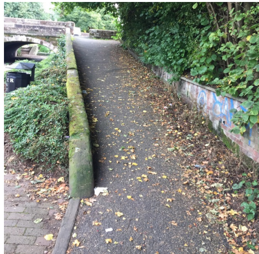
Canal walk linking Newport and Harper Adam's University