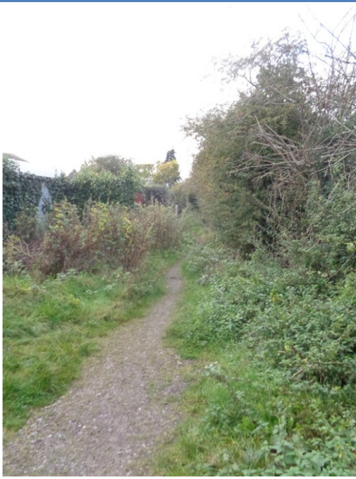
Overgrown walking route in Wellington