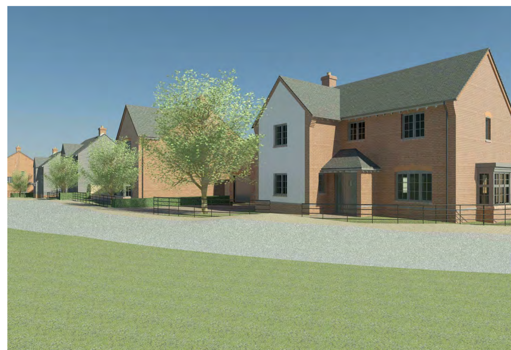
Camera 17: Street 11 looking east