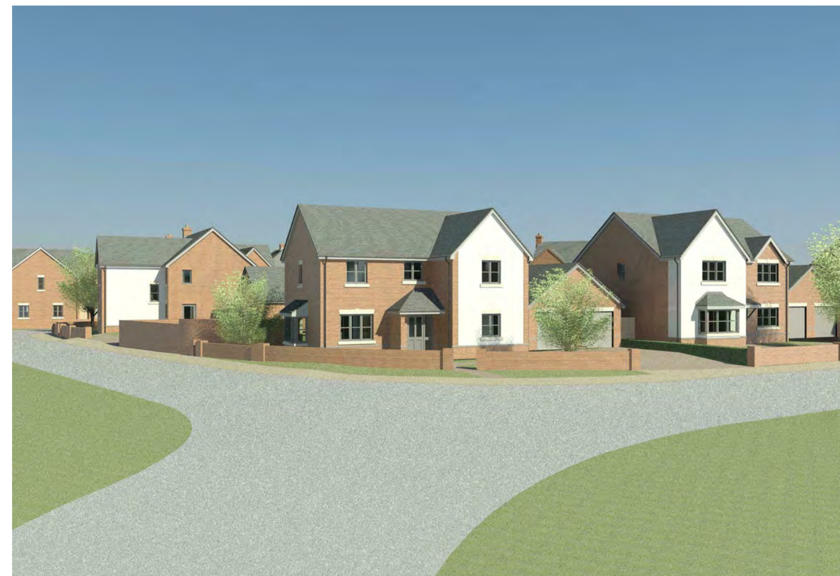
Camera 11: Junction peregrine way & pintail drive looking west