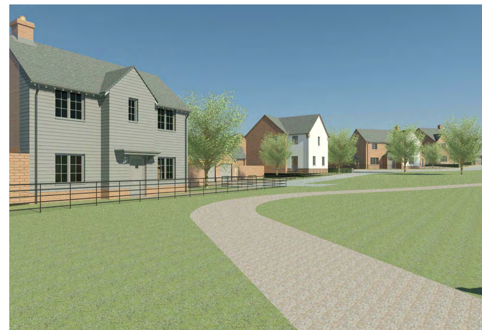
Camera 15: Street 12 looking southeast