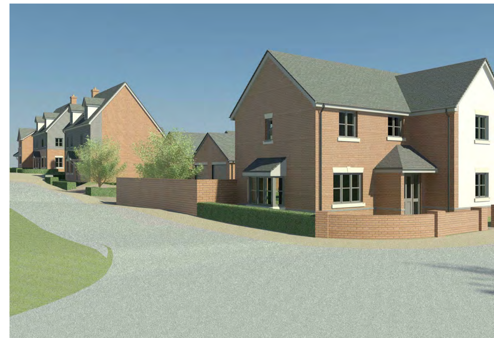
Camera 12: Junction eider drive & street 9 looking southwest