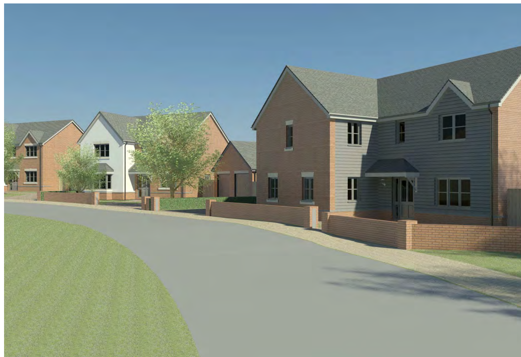
Camera 10: Peregrine way looking south