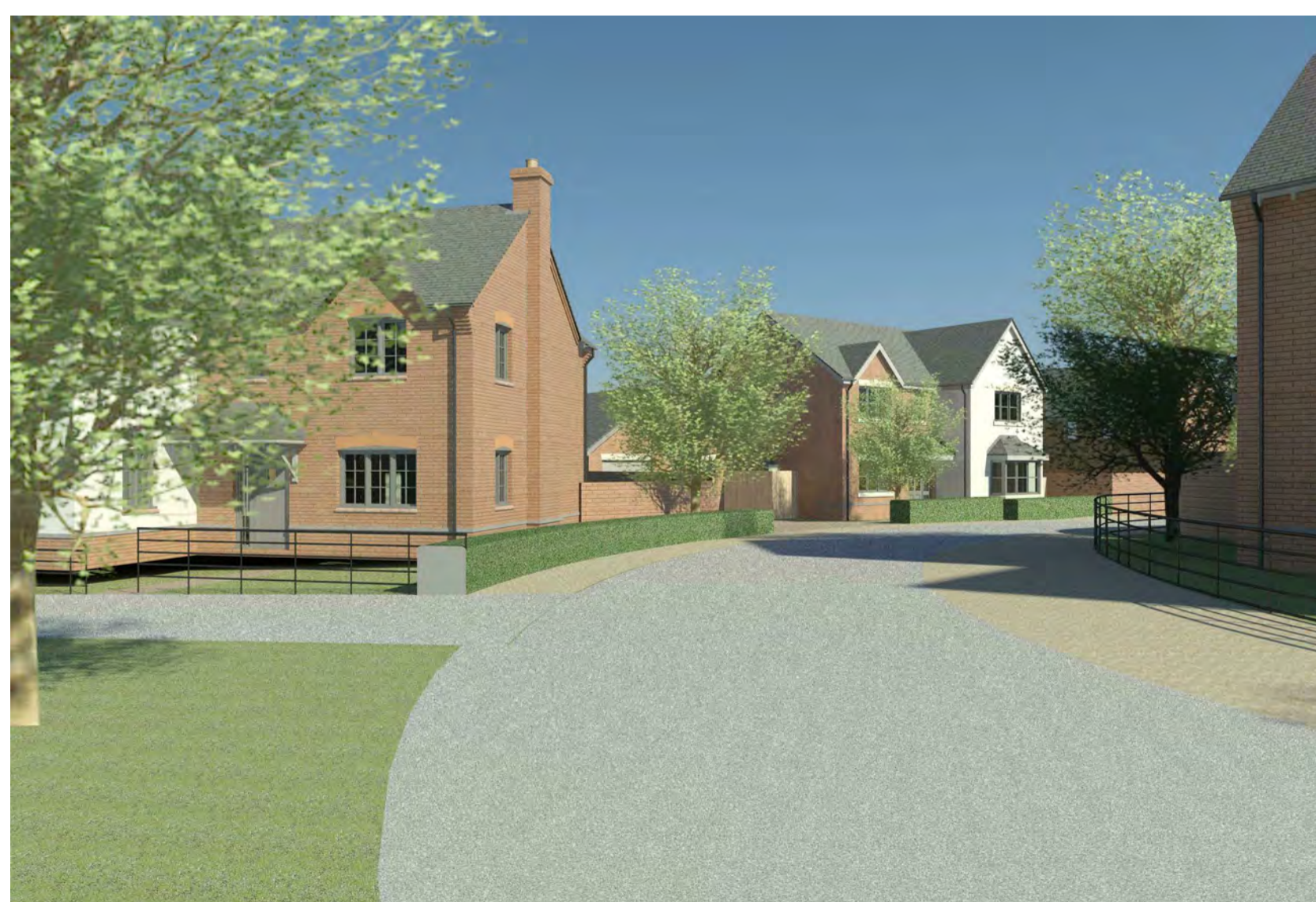
Camera 16: Junction street 11 street 7