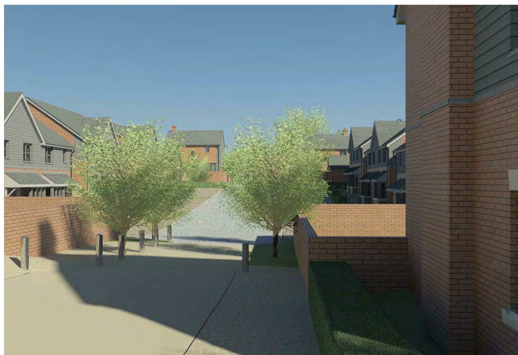
Camera 13: Street 8 looking northwest