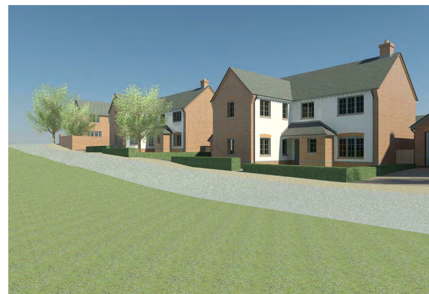
Camera 18: Street 10 looking north

Responsibility is not accepted for errors made by others in scaling from this drawing. All construction information should be taken from figured dimensions only.