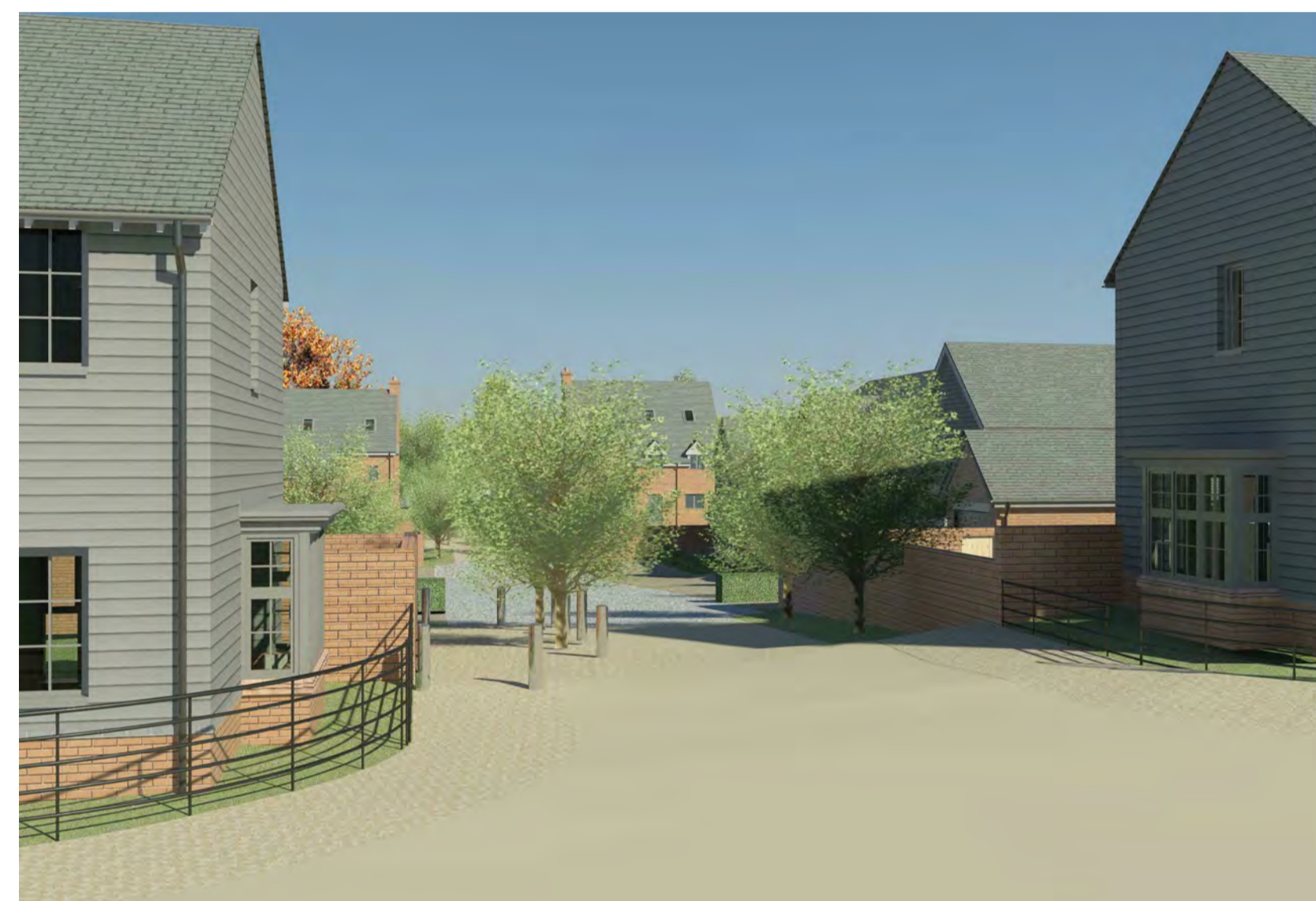
Camera 14: Street 8 looking south