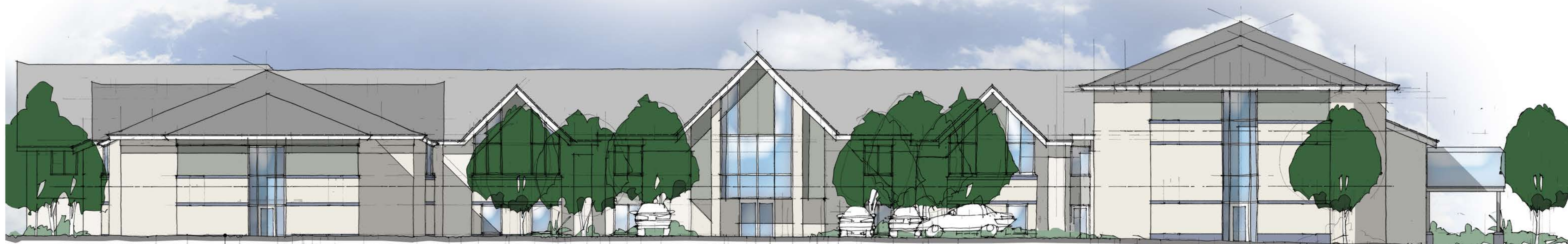
Proposed Rear Elevation [Facing North] [Scale 1:100]