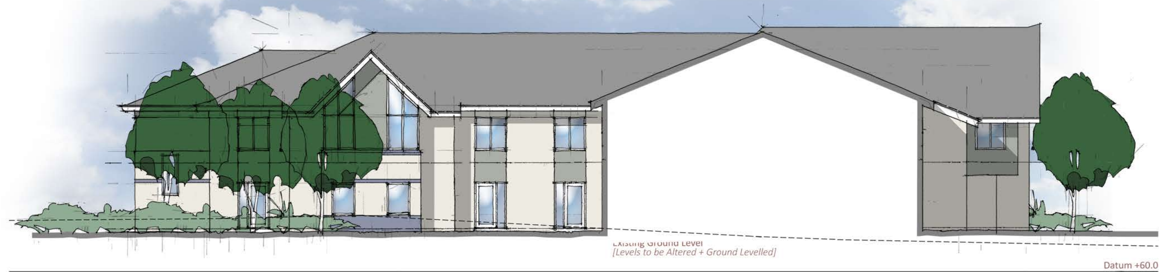
Proposed Sectional Side Elevation [Facing East] [Scale 1:100]

Existing Ground Level [Levels to be Altered + Ground Levelled] Datum +60.0