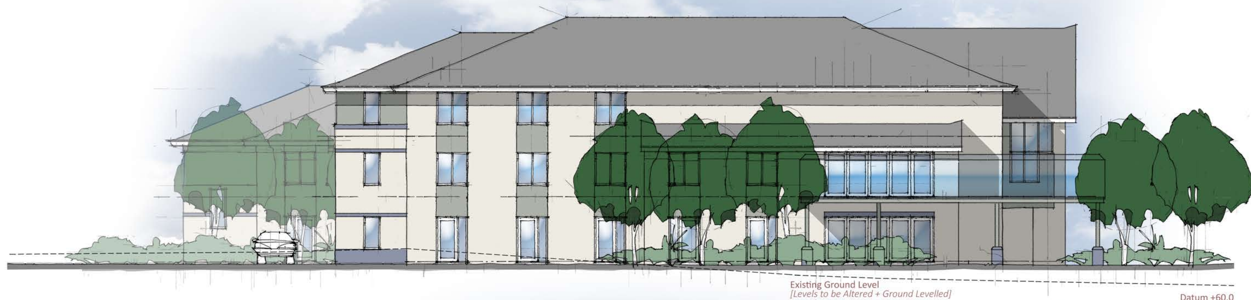
Proposed Side Elevation [Facing East] [Scale 1:100]

The Builder is to check and verify all buildings and site dimensions, levels and sewer invert levels prior to commencement of work. Do not scale off this drawing, work to figured dimensions only. This drawing must be read and checked with all structural and relevant specialist drawings. The Builder is to comply in all respects with the current Building Regulations and latest Codes of Practice.