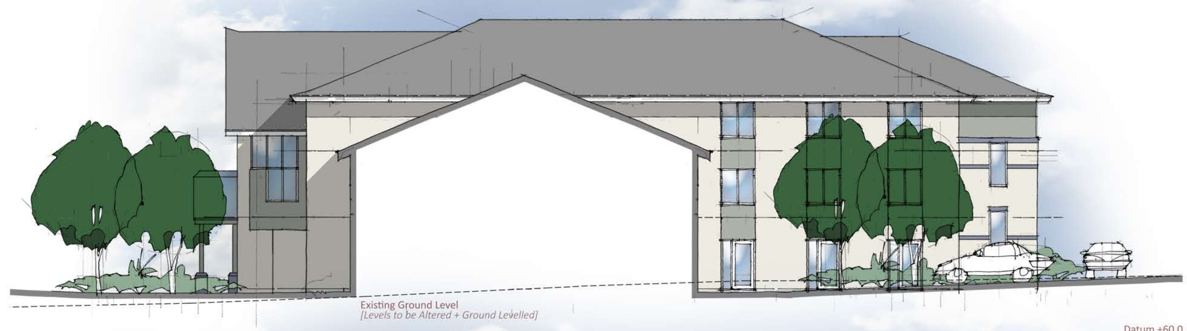
Proposed Sectional Side Elevation [Facing West] [Scale 1:100]

Existing Ground Level [Levels to be Altered + Ground Levelled] Datum +60.0