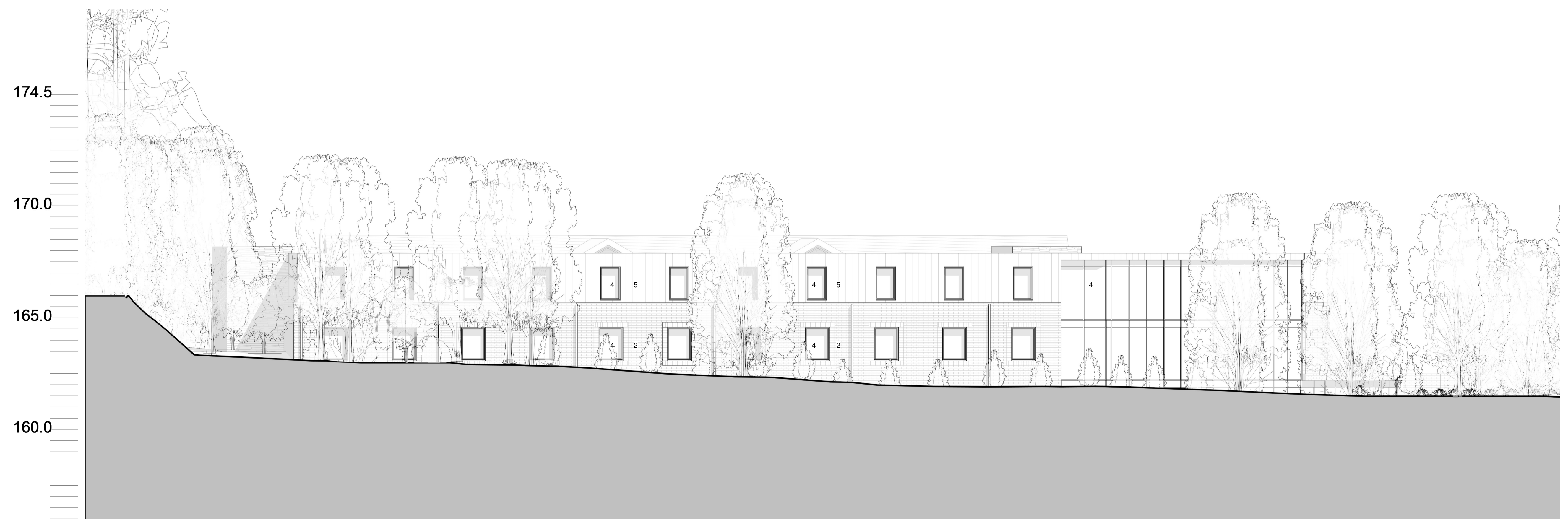
Elevation 3 1 : 100