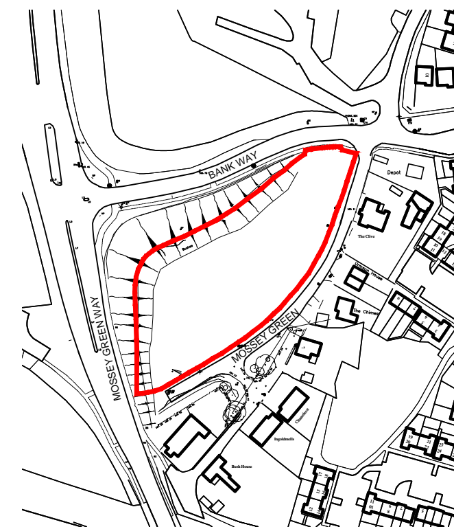
Location Plan 1:2500