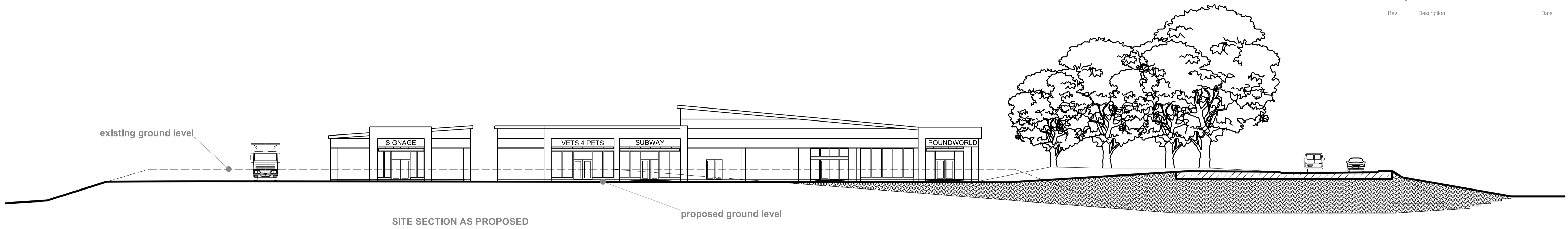
SITE SECTION AS PROPOSED