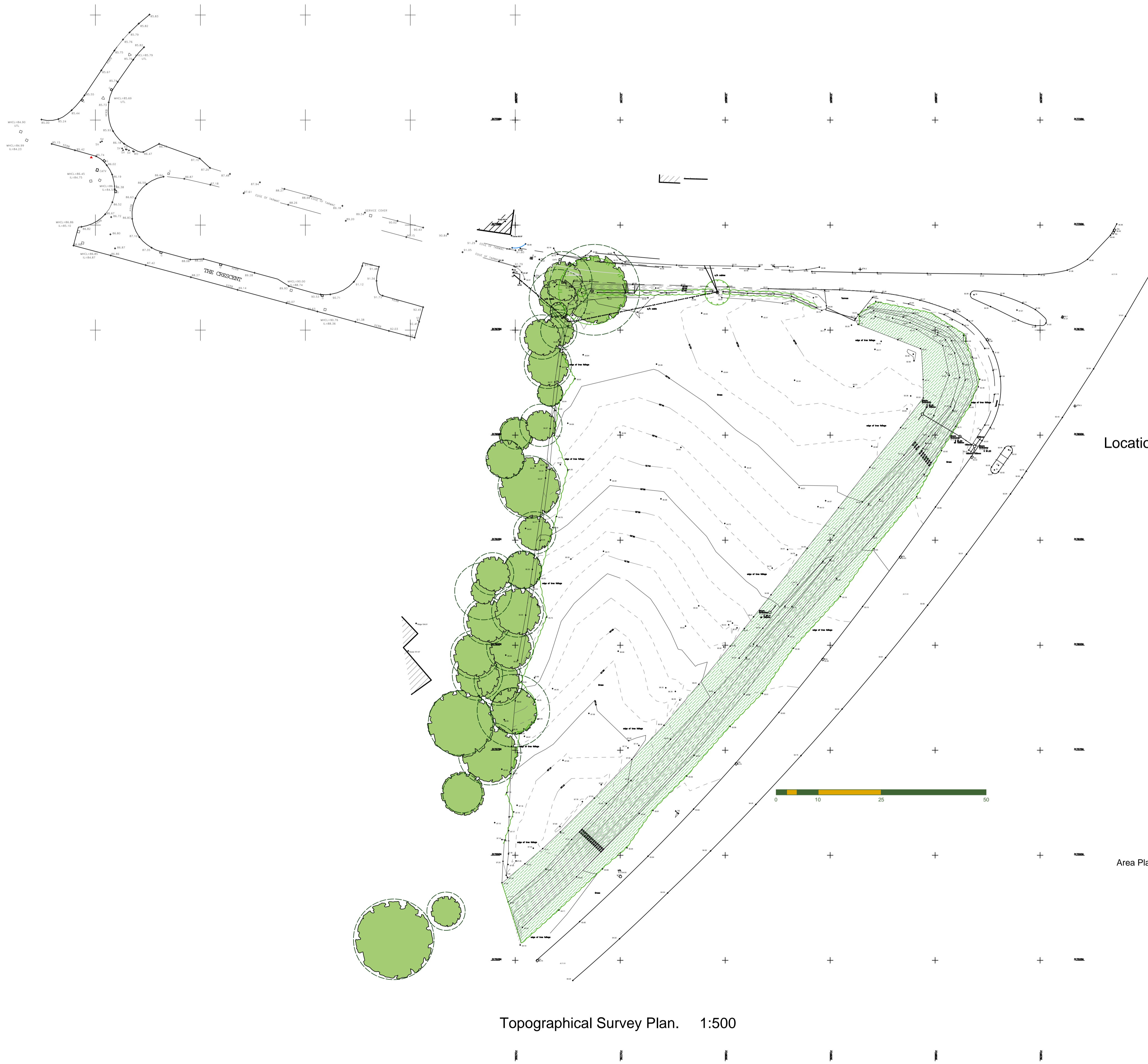
Topographical Survey Plan. 1:500