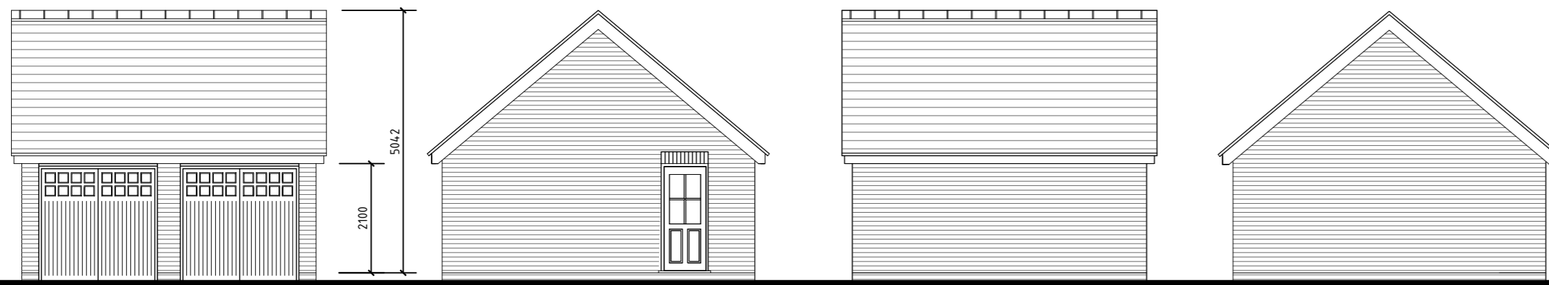
Front Elevation Side Elevation Rear Elevation Side Elevation