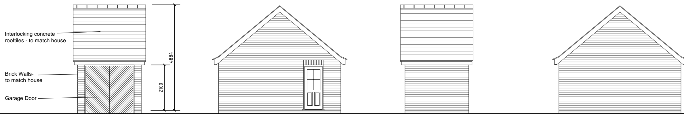
Front Elevation Side Elevation Rear Elevation Side Elevation