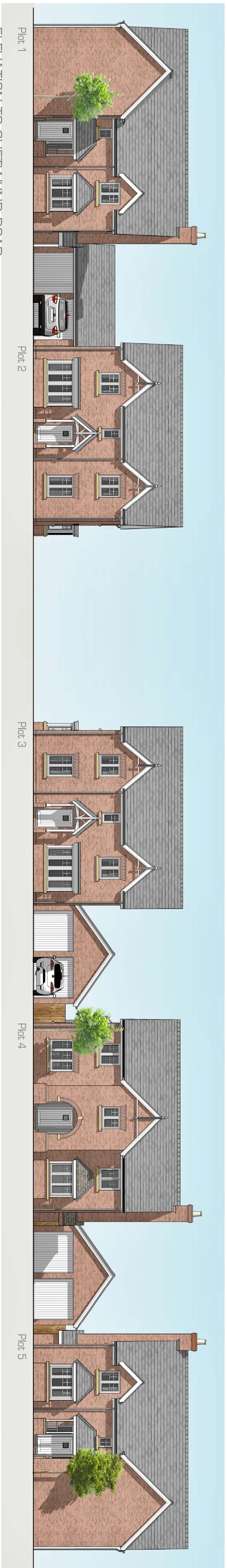
Plot 1 ELEVATION TO CHETWYND ROAD