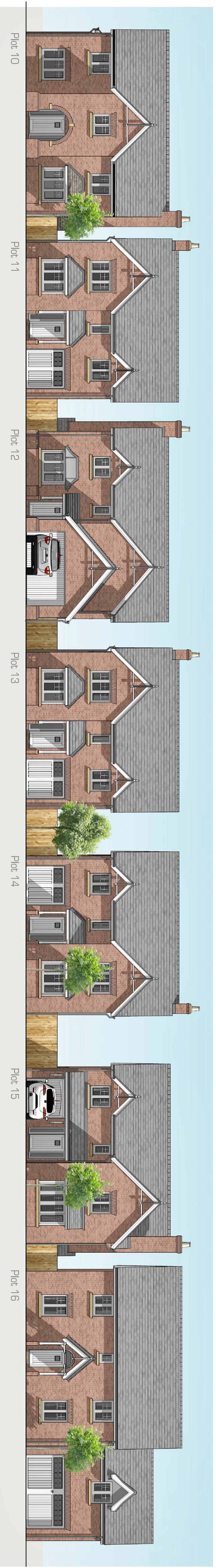
Plot 10 ELEVATION NORTH FROM STREET 1