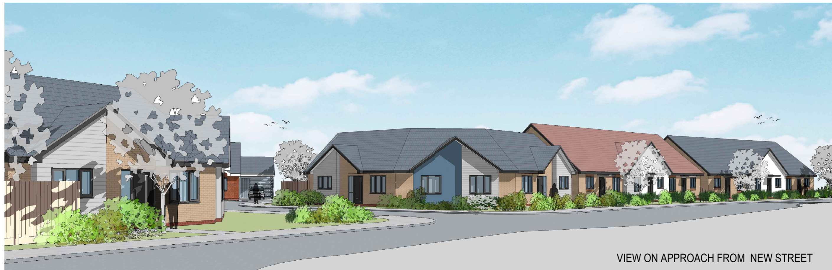
VIEW ON APPROACH FROM NEW STREET