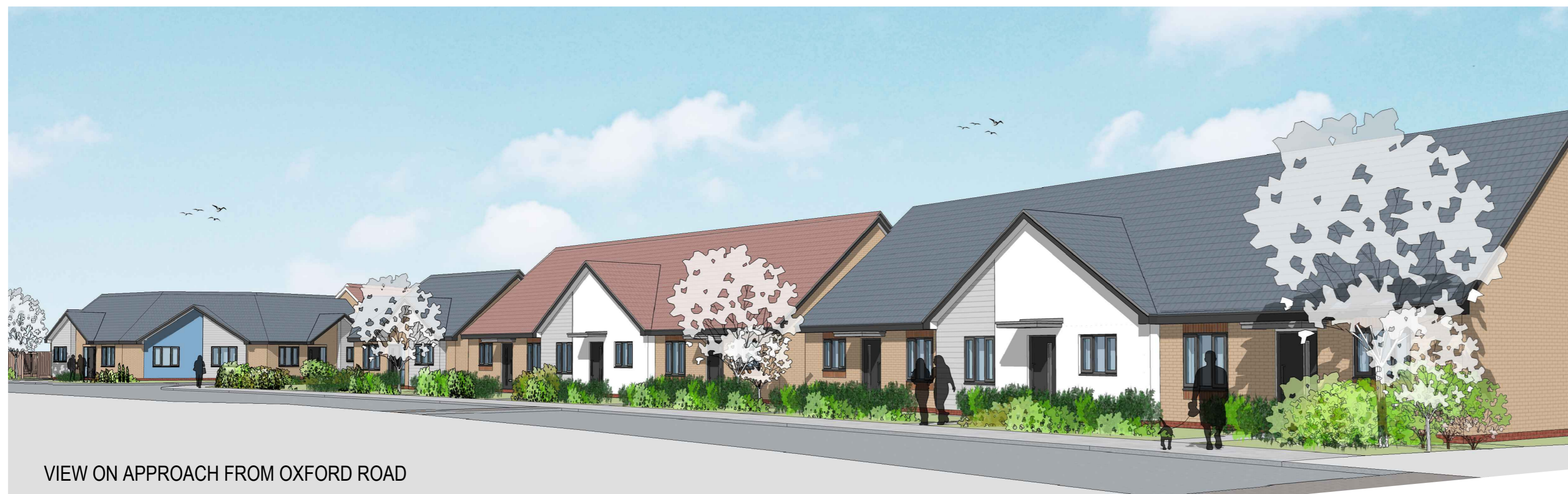
VIEW ON APPROACH FROM OXFORD ROAD