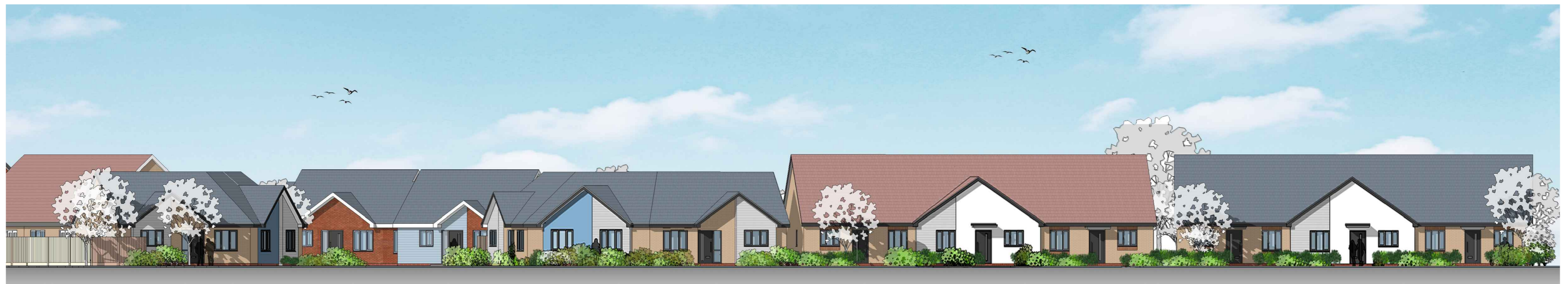
DUCE DRIVE STREET ELEVATION - Scale 1:200