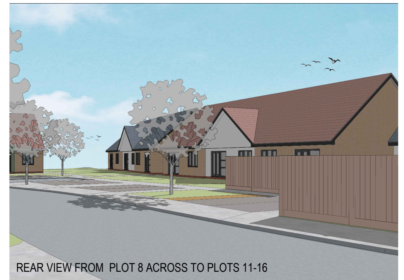
REAR VIEW FROM PLOT 8 ACROSS TO PLOTS 11-16