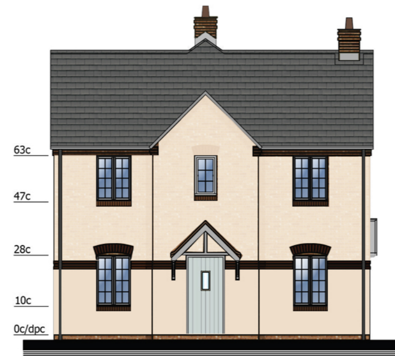
Side Elevation 1:100 ( Kedington )