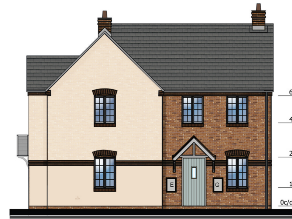
Front Elevation 1:100 ( Kedington ) ( Weston )