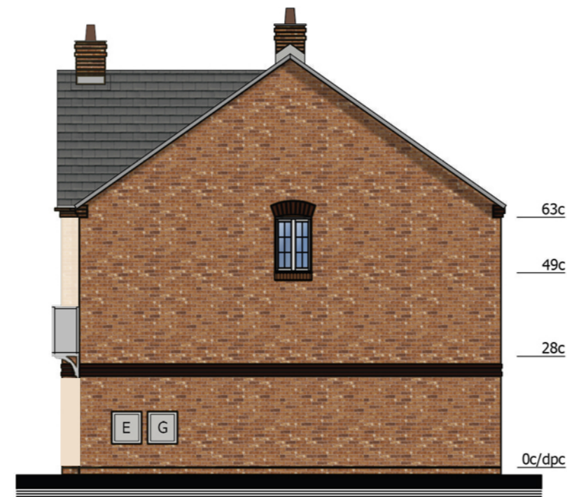
Side Elevation 1:100 ( Weston )