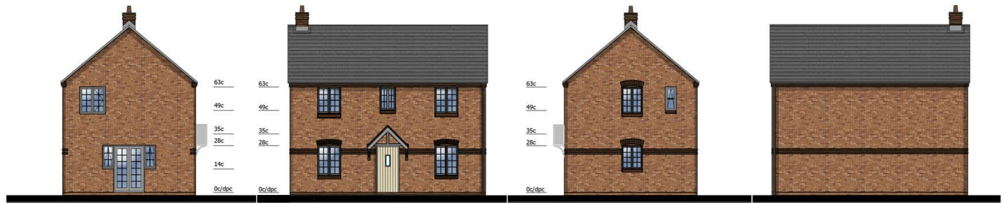
Side Elevation 1:100