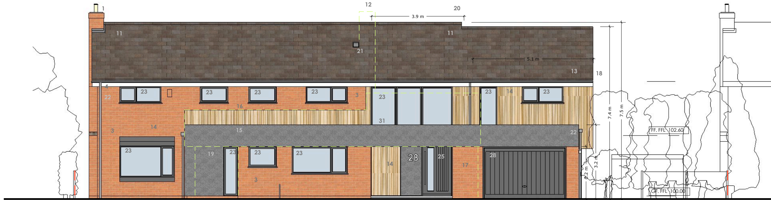
001 ELEVATION - FRONT (NORTH WEST) 1632_022 scale: 1:100