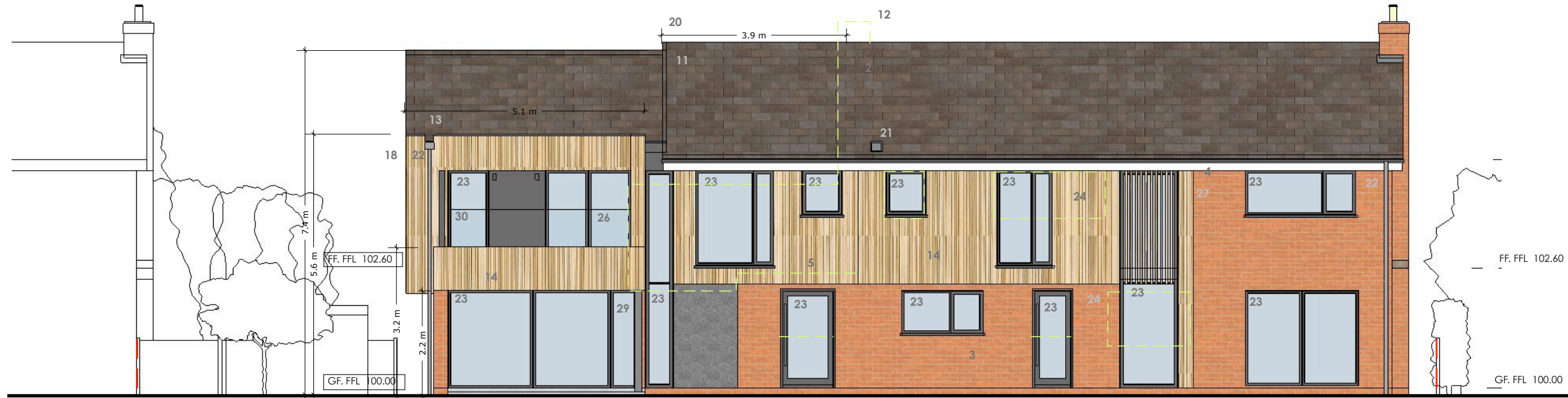
001 ELEVATION - REAR (SOUTH EAST) 1632_023 scale: 1:100