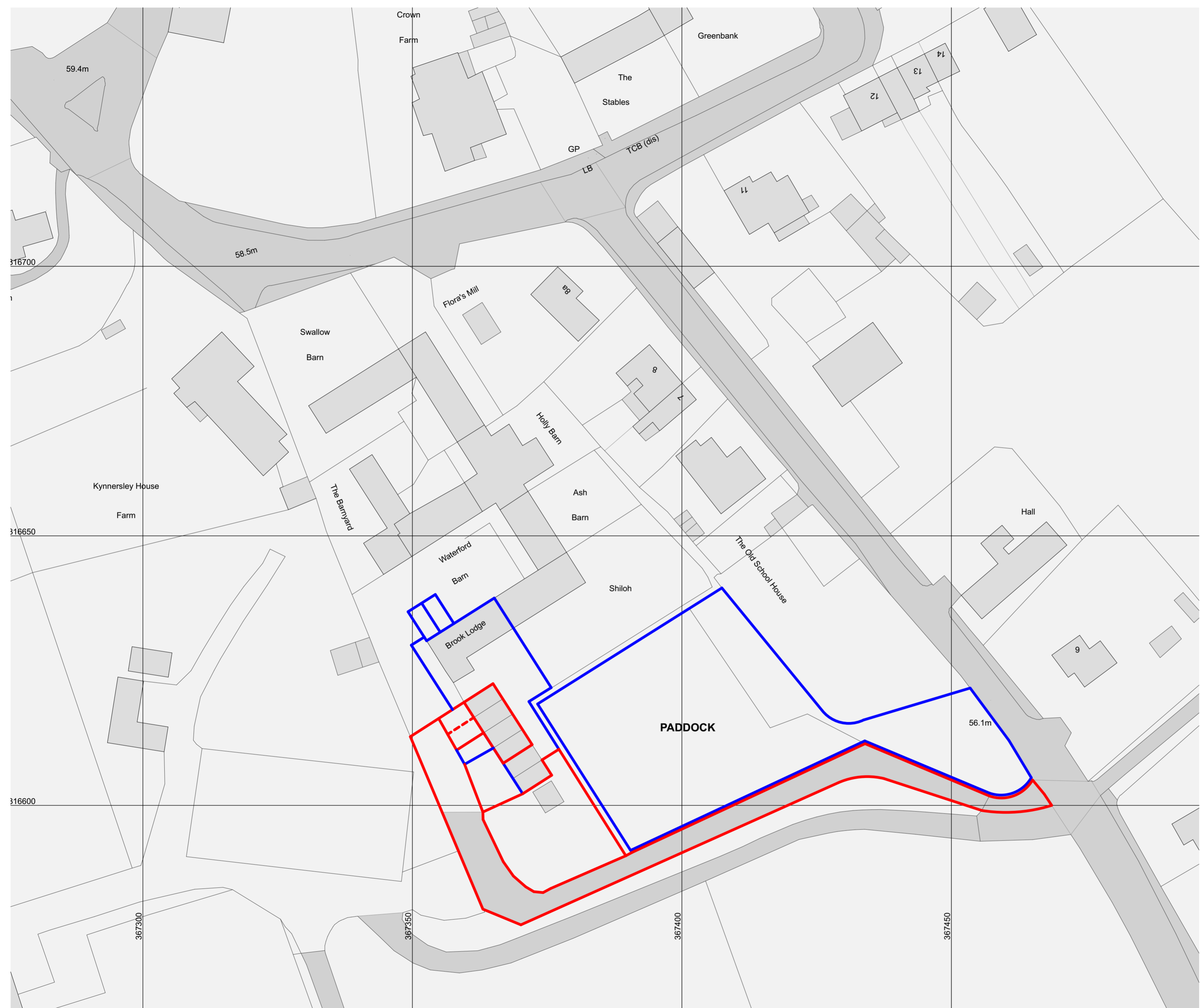
1 Site Plan 1:500